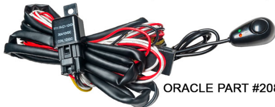
ORACLE PART #2088-504

The light bar is designed to work with the factory AUX switches if your vehicle is not equipped with the factory AUX switches you can add the optional wiring harness which includes a switch (SOLD SEPARATELY).