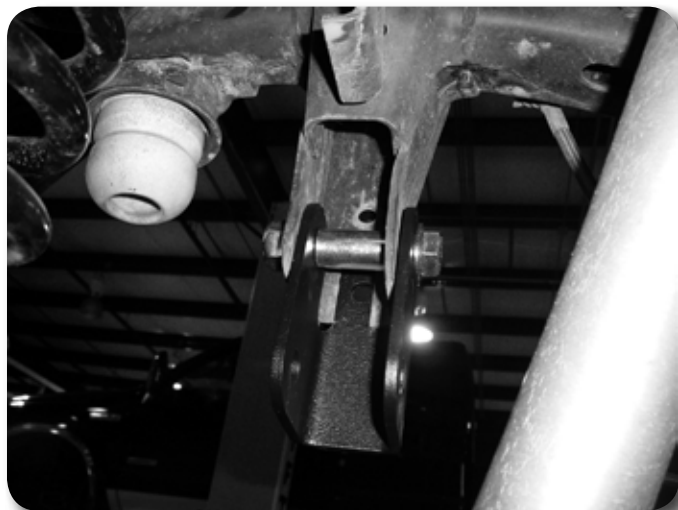
Figure 9 - LHD Shown