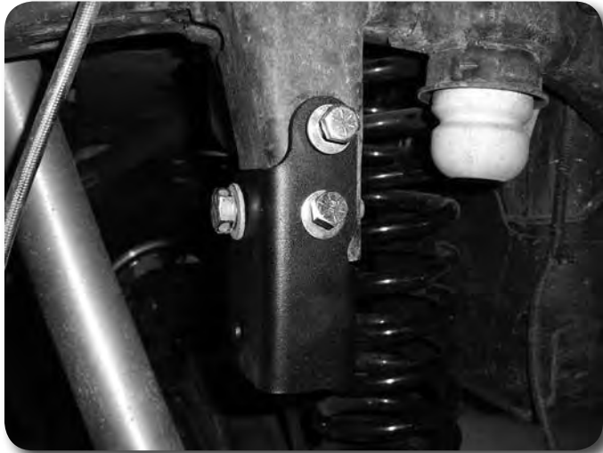
Figure 10 - LHD Shown