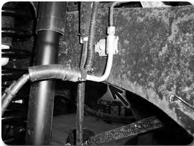
Figure 4b - Before

All model years: Check the slack in the brake lines by turning the wheels from lock-to-lock. It may be necessary to slightly reform the brake line hardline at the frame down about 10-15 degrees to provide more slack in the line Figure 4b/c . Carefully bend the hard line with your hands.