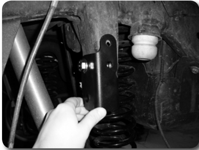
Figure 8a - LHD Shown