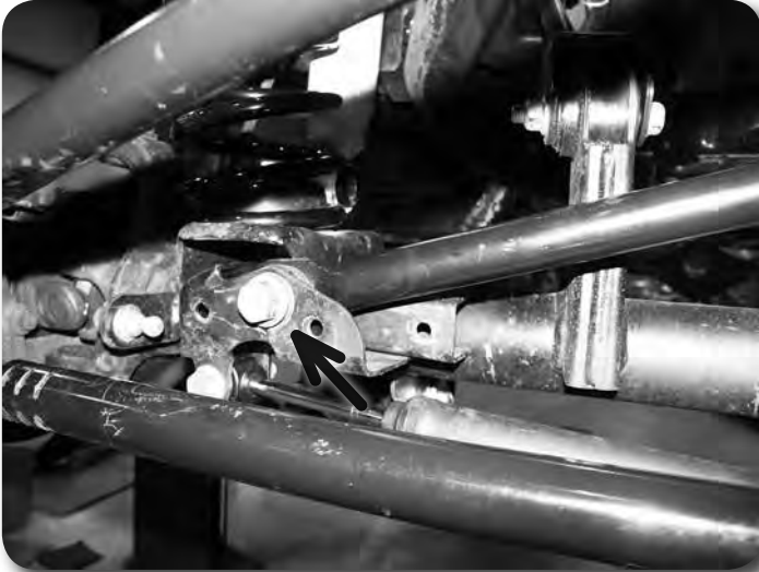
Figure 1 - Left Hand Drive Shown