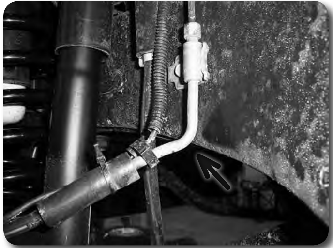
Figure 4c - After