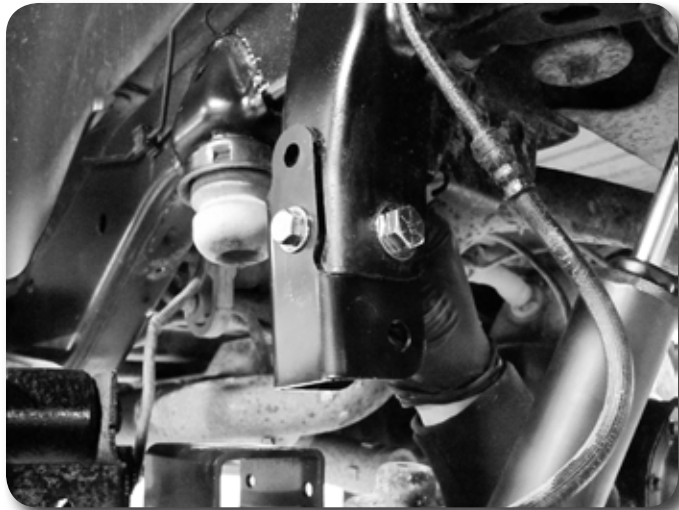
Figure 8b - RHD Shown