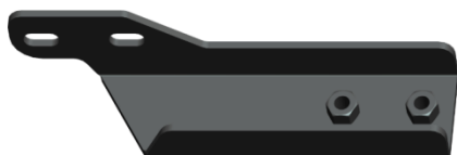
Passenger Side Bracket