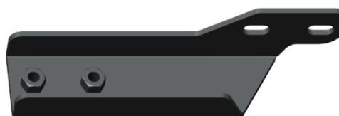
Driver Side Bracket