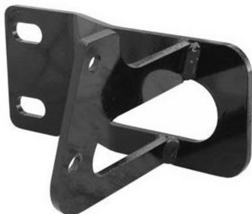
Passenger Side Mounting Bracket