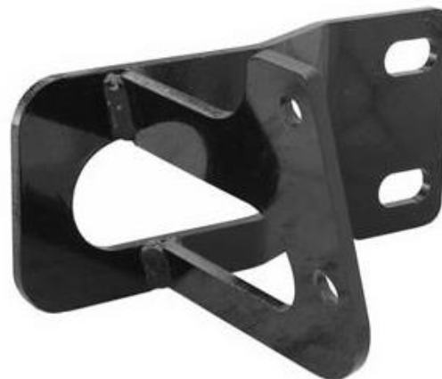
Driver Side Mounting Bracket