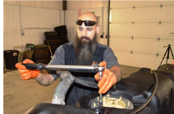
(Fig. 3) Place the sending unit into the TITAN tank, install the top flange, and tighten the nylon lock nuts to 20 ft. lbs using a “star” pattern using a torque wrench.