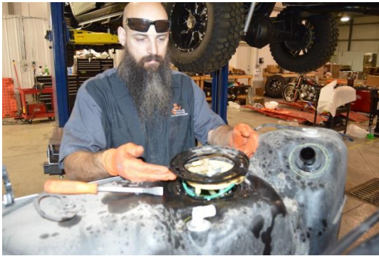
(Fig. 2) Loosen the hold-down ring on the OEM tank by turning counter-clockwise. Note where the connections on your vehicle’s sending unit are “clocked” and install so they are located in the same position in the new tank.