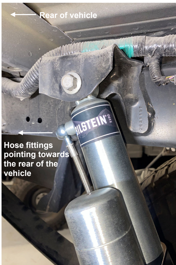
Figure 3. Driver Side