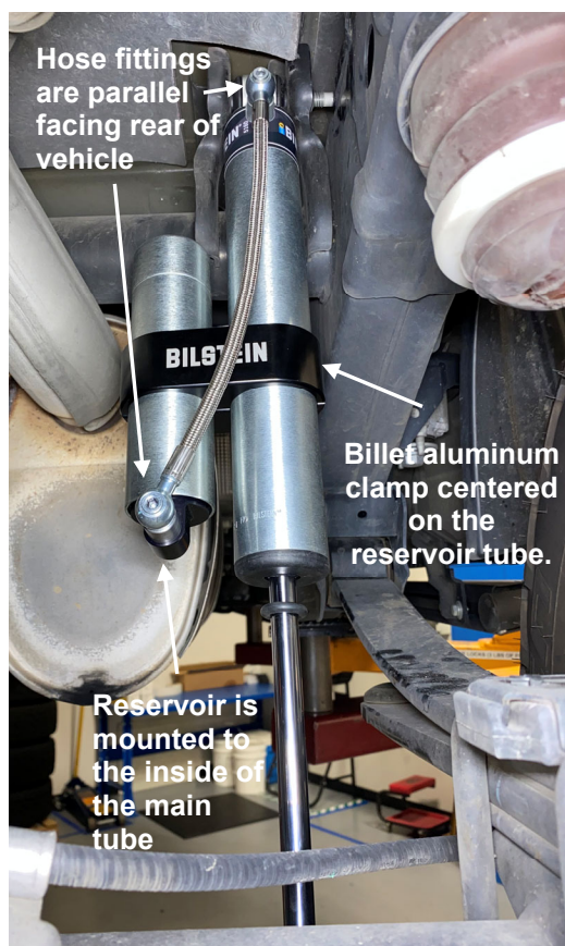
Figure 2. Passenger Side (Rear View)