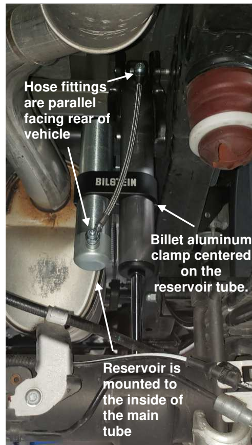
Figure 2. Passenger Side (Rear View)