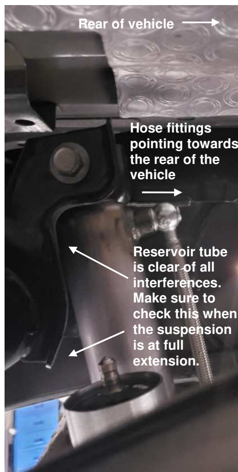
Figure 4. Passenger Side