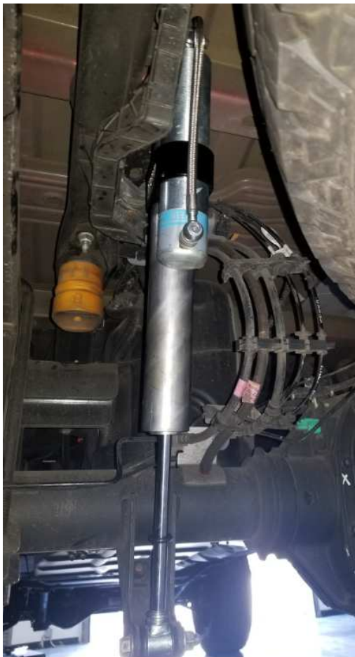
Figure 4. Rear Driver Side (View from rear)