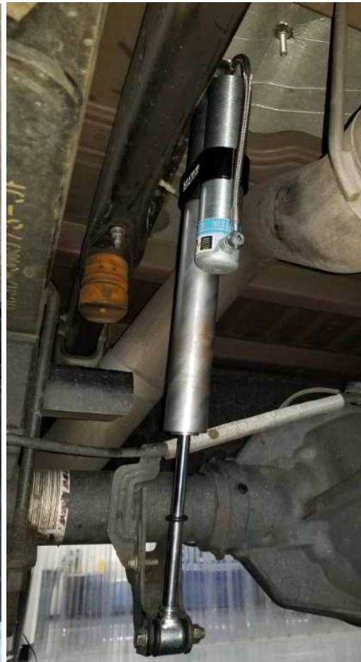
Figure 5. Rear Passenger Side (View from front)