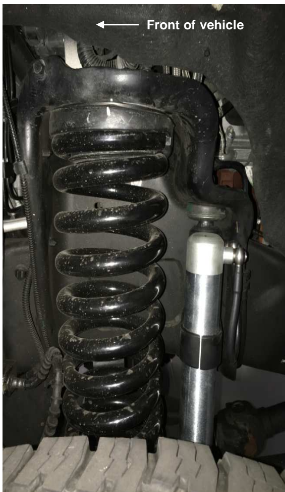
Figure 1. Driver Side