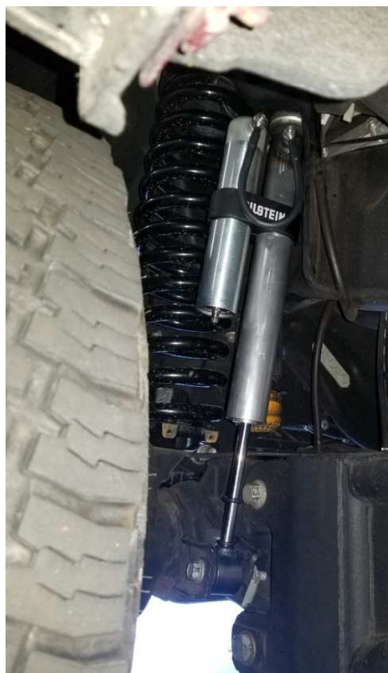
Figure 2. Driver Side