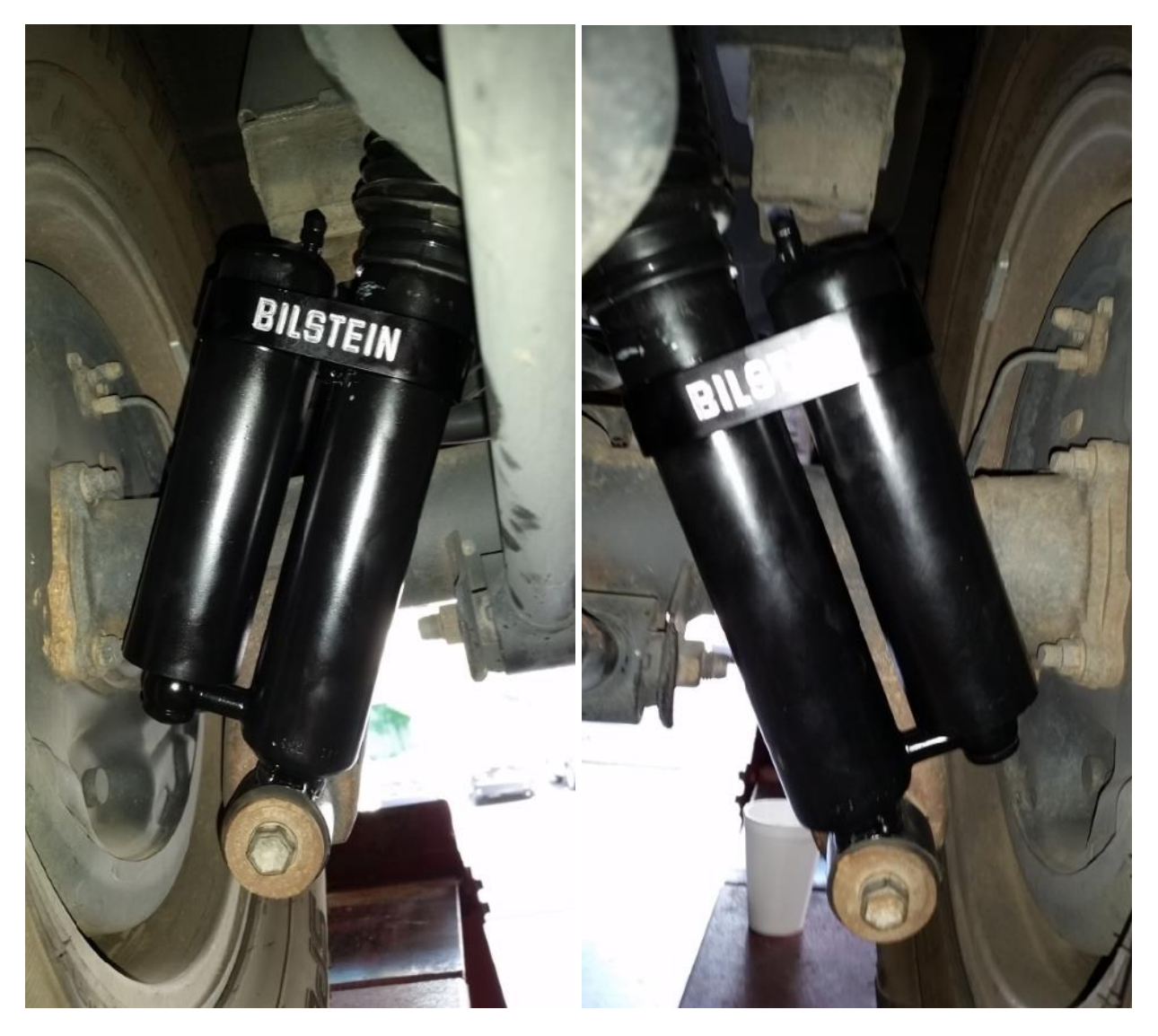
Figure 2 – RIGHT REAR (looking towards the rear)