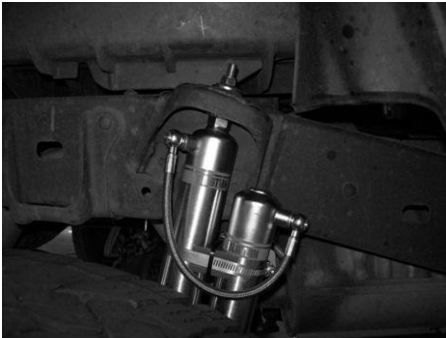
Figure 1. rear driver side