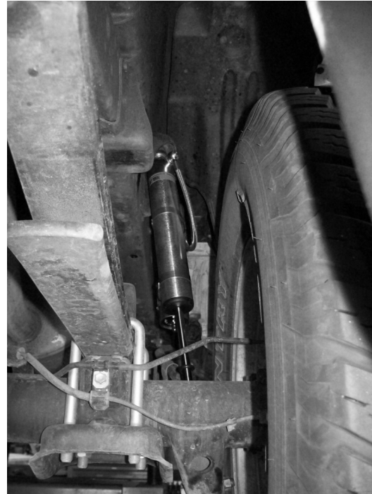
Figure 3. rear passenger side