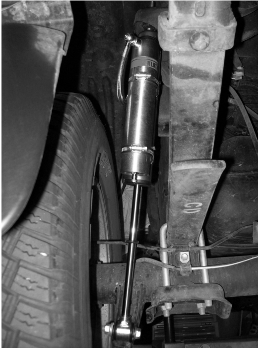
Figure 2. rear driver side