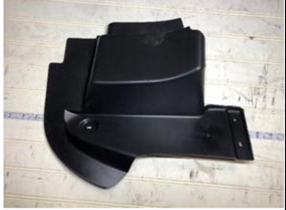
Figure 6 - Right Side After Trimming