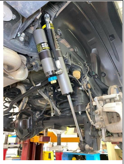
Figure 4 - Rear Passenger Side