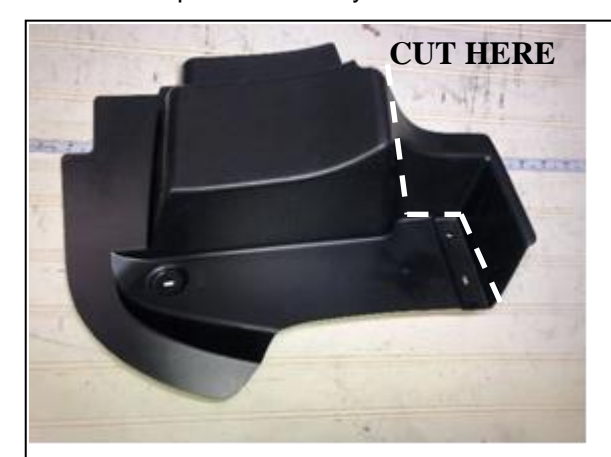
Figure 5 - Right Side Before Trimming