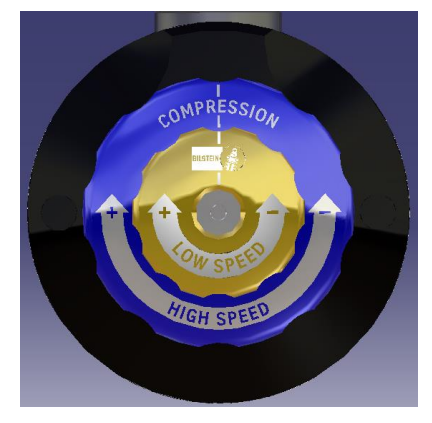
Dual Speed Reservoir Adjuster

Please note: It's normal for the high speed (blue) knob to become significantly more difficult to turn when progressing to the firmer end of the adjustment range; particularly during the last 3 to 4 settings/clicks. This increased difficulty is a result of the increasing preload of the high speed valve stack shims. To aid in ease of adjustment at the firmest end of the high speed range, it's optional to use Bilstein wrench part # E-XS01-0000004. This is included in most kits and if not, available separately. Additionally, it's normal for the clicks on the high speed (blue) knob to become less pronounced at the firmer end of the adjustment range.