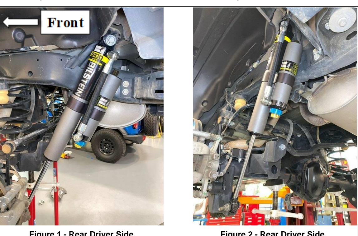
Figure 1 - Rear Driver Side