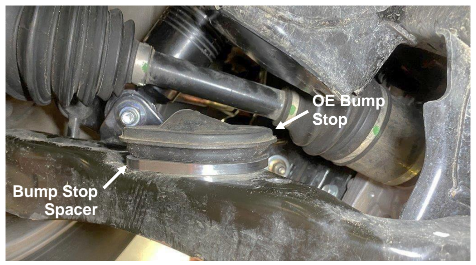
Figure 2: Bump Stop with Installed Spacer