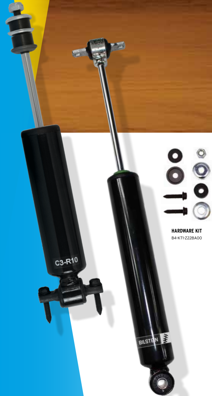
HARDWARE KIT B4-KT1-Z228A00