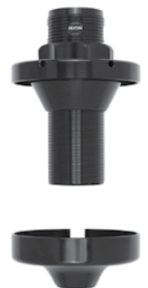
5" COILOVER KIT B4-MKT-0007A00