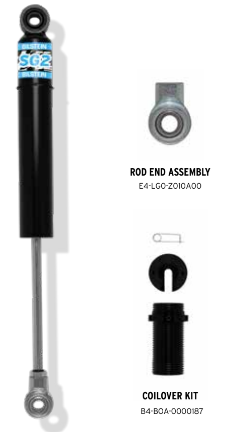
ROD END ASSEMBLY E4-LG0-Z010A00