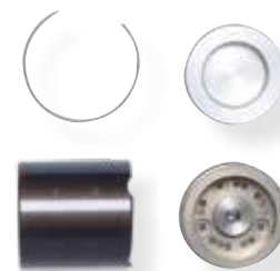
BASE VALVE KIT B4-MKT-0005A00