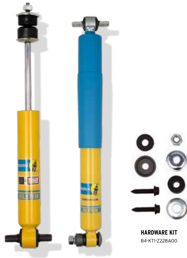
HARDWARE KIT B4-KT1-Z228A00