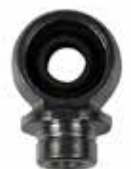
ROD END ASSEMBLY B4-LG0-Z010A00