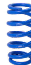
550LB/IN SPRING E4-MCS-0057A00