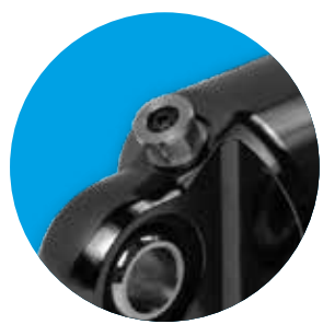
IMCA FILL PLUG B4-MVP-0019A00