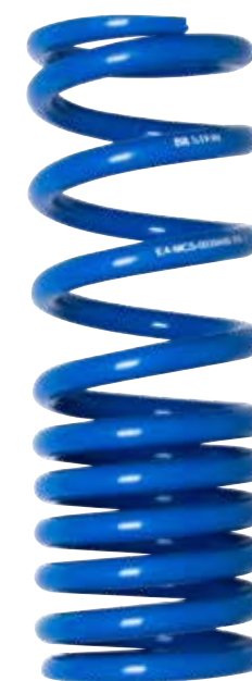
RR-3 (RIGHT REAR) DIRT LATE MODEL SPRING B4-MKT-0007A00

Introducing the latest innovation from BILSTEIN Shock Absorbers: a purpose-built line of suspension springs designed specifically for Dirt Late Models. Crafted through a world-class engineering collaboration with renowned motorsports engineer Kevin Rumley, BILSTEIN's spring line offers the perfect range of options to tune for any track condition and configuration. Each spring is designed and manufactured to provide the race-winning advantage with optimized performance and consistency that has been competition-proven with the most successful teams in the industry. Champions rely on BILSTEIN's innovative technologies pushing the boundaries of excellence in motorsports worldwide and the new spring line takes the BILSTEIN suspension system to the next level of success.