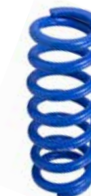
525LB/IN SPRING E4-MCS-0061A00