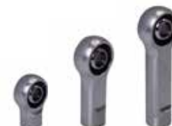
ROD END ASSEMBLY