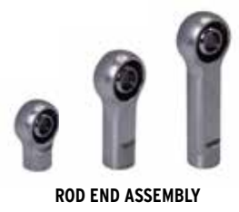
ROD END ASSEMBLY