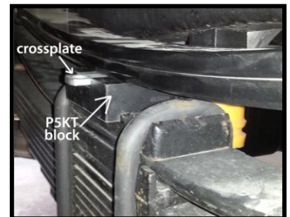
2011~present Ford spring plate with factory top overload