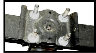
Older model Ford spring

Step 9: Re-check installation to ensure that all a/c lines, brake cables and truck frame will not interfere with the vertical travel of the SuperSprings.