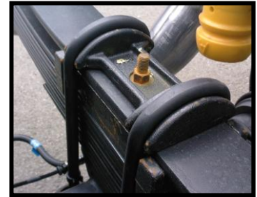
2011~present Ford spring