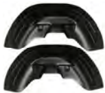
Driver Side & Passenger Side Liner 1 pr