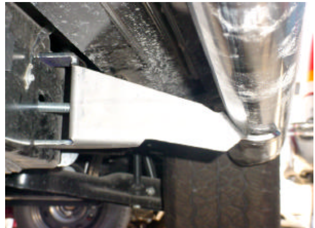
Front bracket installed. (Passenger side).