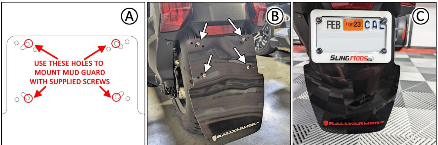
IMAGE C Re-install license plate and plate holder over mud guard.

IMAGE B Place mud guard against corresponding mounts, then install .75SS#10 screw into all four points.