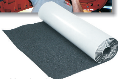
Silencer Megabond: apply to back side of headliner