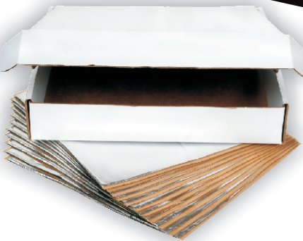
HushMat Ultra™: apply to roof