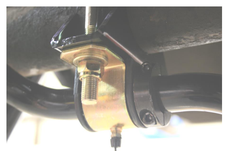
Figure 6 - Split Collar Clamp