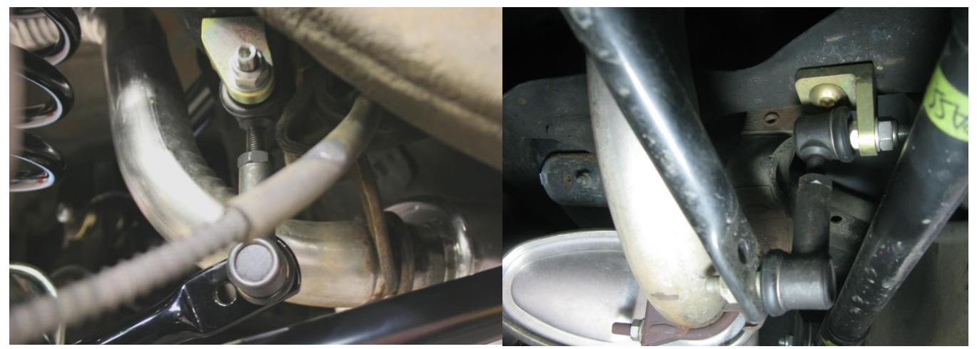
Figure 2 - Upper Mounting Bracket Orientation (Passenger Side Shown)

3. Install the upper link mount brackets on the crossmember. See Figure 2 for reference on the correct placement of the bracket. The mount points to the front of the car and the vertical bend to the outside of the car. Use the provided 3/8"-24 x 1-1/4" L Hex Head Bolts inserted from the bottom along with the 3/8"-24 Nylock Nut and 3/8" AN washer. Torque these bolts to 35 ft-lbs.