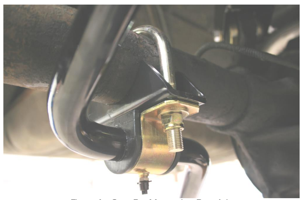
Figure 4 - Sway Bar Mounted on Rear Axle

6. Install the sway bar end links on the sway bar and the upper link mounts. Set the end links so that they measure 3-1/2" from the centerline of the upper stud to the centerline of the lower stud, then position the link so the lower stud points inboard of the car while the upper stud points outboard. Torque the upper nut to 40 ft-lbs and the lower nut to 40 ft-lbs. NOTE : There are two mounting points on the sway bar for the sway bar end link. The chart below in Figure 5 lists the rate for each hole. DSE recommends using the forward mounting hole.