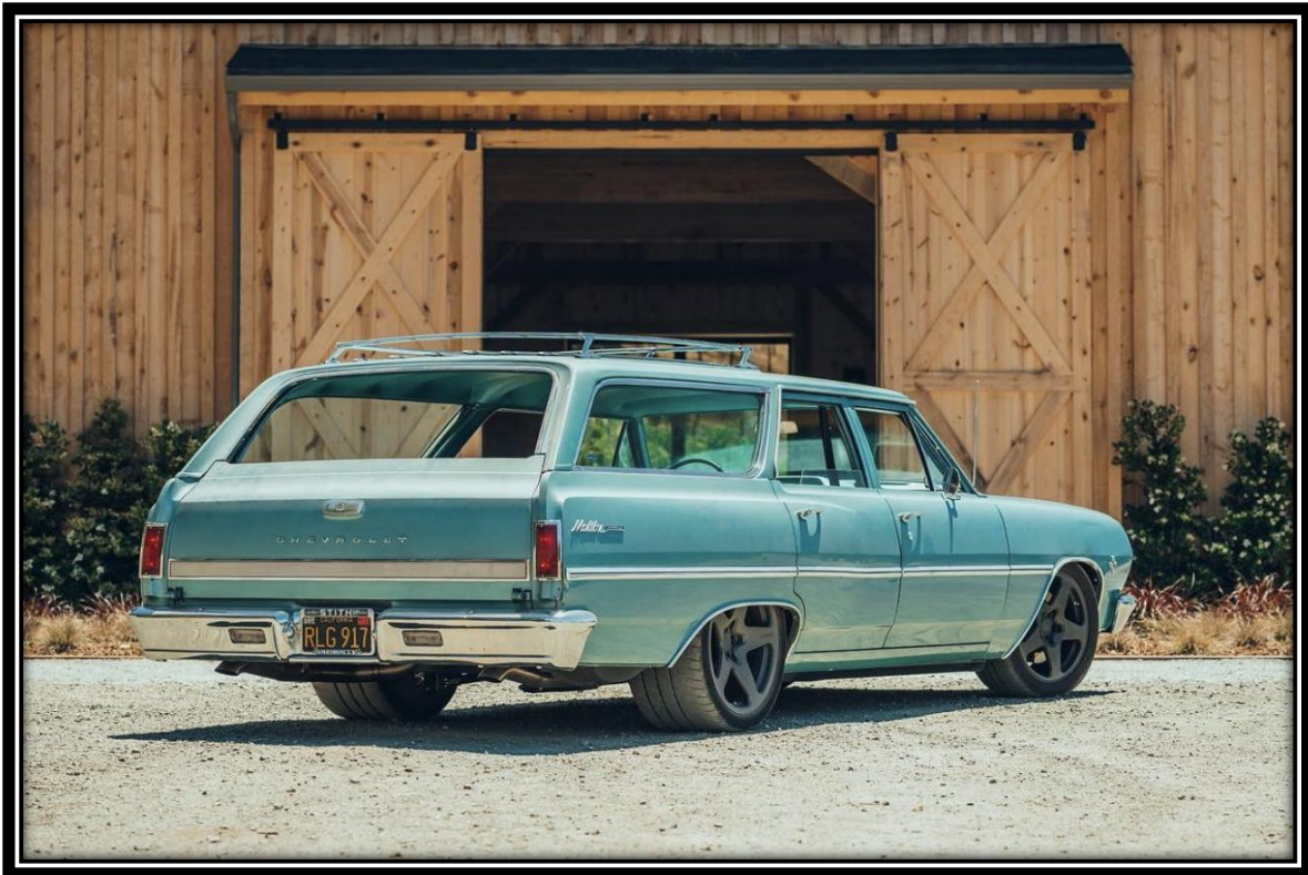
Figure 1: 1964 Chevelle Wagon features our Extreme Chassis

Congratulations on the purchase of your new Speedtech Performance aluminum body mounts. Use only approved, appropriately rated jack and jack stands, and take all required safety precautions to complete the job safely and correctly. If you have any uncertainties, seek the assistance of a highly qualified workshop.