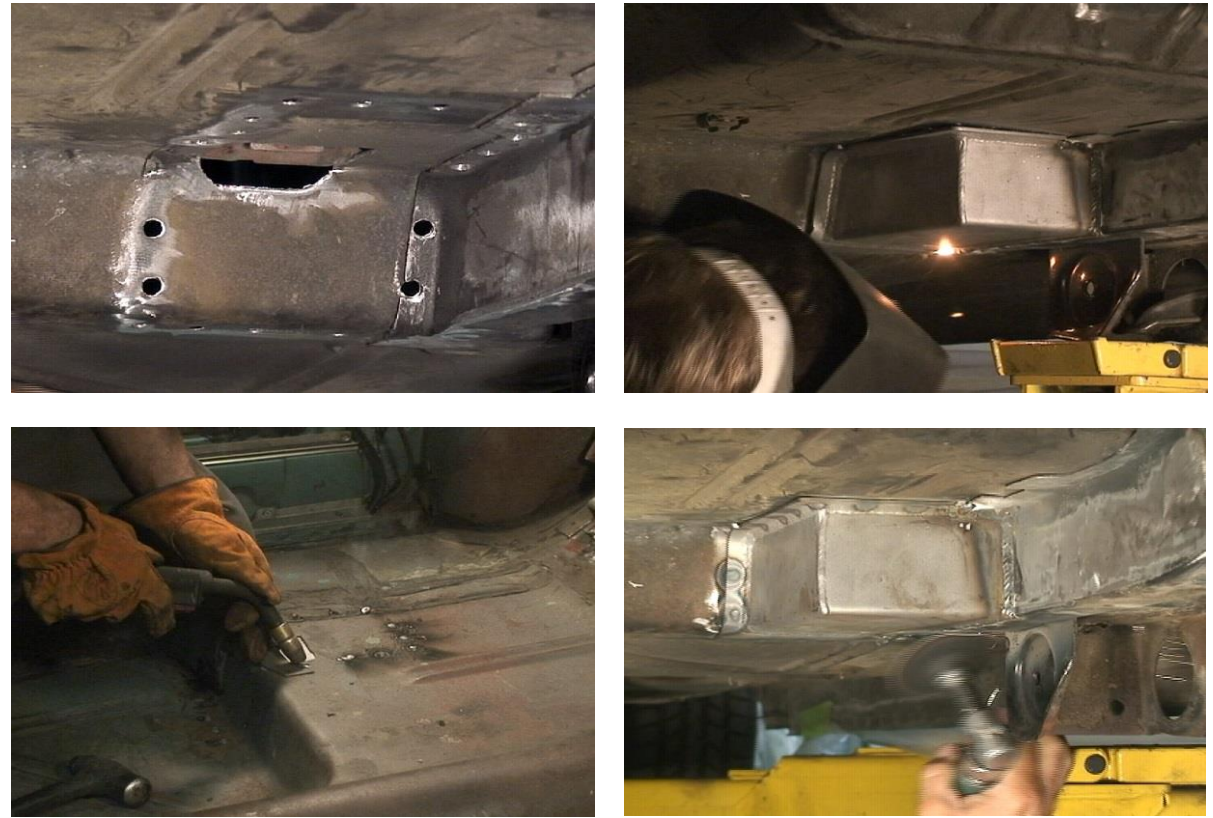
Torque Box Installation

If you have any questions before or during the installation of this product please contact Detroit Speed Inc. at tech@detroitspeed.com or 704.662.3272