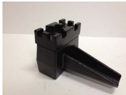
1.5" REAR LIFT OPTION