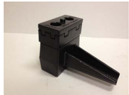
2.0" REAR LIFT OPTION

IMPORTANT! THIS IS A PATENTED, MECHANICALLY-SECURED & INTERLOCKING SYSTEM DESIGNED ONLY TO BE USED ALONE OR WITH THE ORIGINAL OE LEAF SPRING BLOCKS REMOVED FROM THIS VEHICLE.