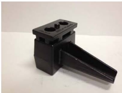
1.0" REAR LIFT OPTION

Step 9: Determine whether you want a 1.0", 1.5" or 2.0" rear lift, and orient the components according to the images shown below to achieve your desired ride height.