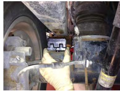
2.0" REAR LIFT OPTION