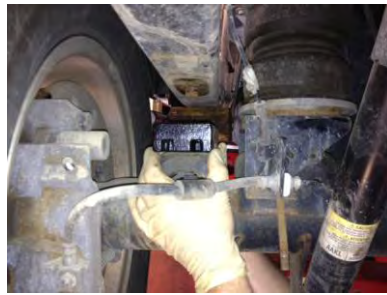
1.5" REAR LIFT OPTION