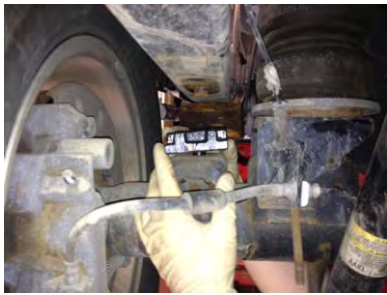
1.0" REAR LIFT OPTION

Step 7: Determine whether you want a 1.0", 1.5" or 2.0" rear lift, and orient the components according to the images shown below to achieve your desired right height. If installing in the 2.0" configuration, be sure that the indicia stamped FRONT on BOTH interlocking blocks is positioned toward the FRONT of the vehicle. (Figure E, below)