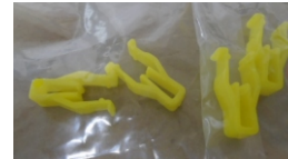
PC-8217-Y - Plastic Panel Clips (4)

All hardware to be put into a R-004 bag and sealed