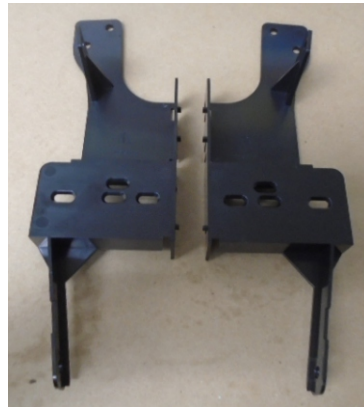
X-TO3LR - HIGHLANDER BRACKETS 2008-12