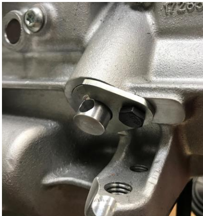
MECHANICAL SPEEDOMETER PORT