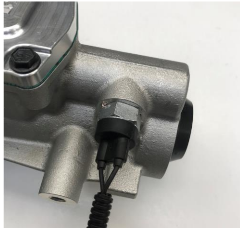
NEUTRAL SAFETY SWITCH