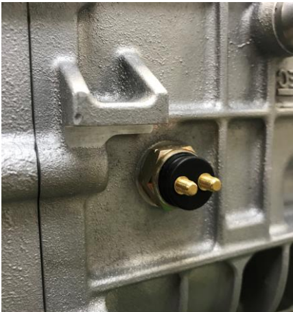
REVERSE LIGHT SWITCH