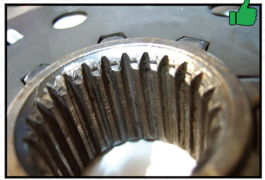
Example of PERFECT AMOUNT OF GREASE. As you can see, it is barely visible to the naked eye and acts as more of a lubricant.