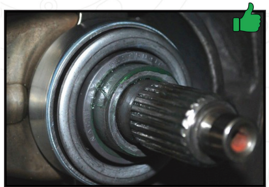
Example of PERFECT AMOUNT OF GREASE on the input shaft. As you can see, it is barely visible to the naked eye and acts as more of a lubricant.