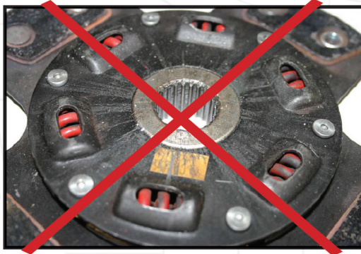
Example of TOO MUCH GREASE. Too much causes grease to spray all over the disc and ruins the disc material or pads.

If you have any questions or concerns, please feel free to contact the Tech Department at info@competitionclutch.com or call 800-869-6598