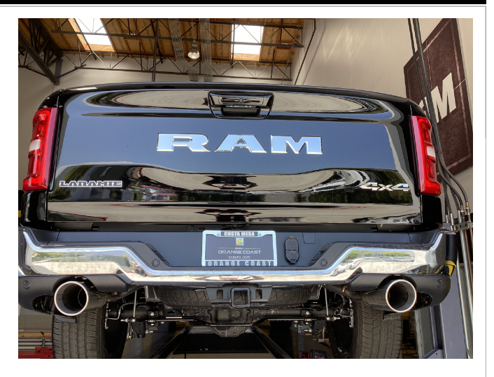
Step 6: Once a final position has been chosen for the new exhaust system, evenly tighten all clamps from front to rear using the torque specifications on page one of the instructions. Inspect all fasteners after 25-50 miles of operation and re-tighten if necessary.

MAGNAFLOW: 1901 Corporate Centre Dr - Oceanside, CA 92056 | 1(800)990-0905 Technical Support: 1(800) 959-9226 | Email: moreinfo@magnaflow.com