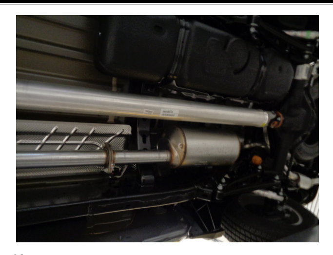
Step 1: Begin by removing the fasteners and gasket at the flange junction of the OE resonator,