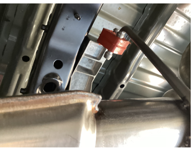
Step 3 : Install the new system by attaching the Muffler Assembly to the OE outlet with supplied hardware and gasket. Locate the welded hangers to the rubber insulators. Leave all clamps loose for final adjustment of the complete syste once installed.

MAGNAFLOW: 1901 Corporate Centre Dr - Oceanside, CA 92056 | 1(800)990-0905 Technical Support: 1(800) 959-9226 | Email: moreinfo@magnaflow.com