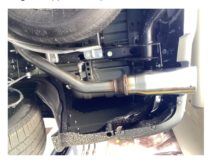
Step 5: Attach the Tailpipe Assemblies to the Mid Pipes using the supplied Clamps, fit the hangers into the rubber insualtors.