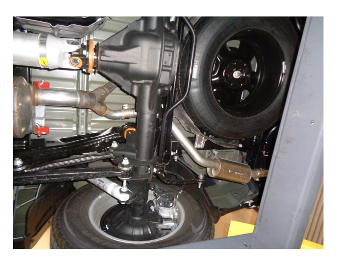
Step 2 Working front to rear disengage all the welded hangers from the rubber insulators and remove the system. (Retain the insulators as they will be needed to mount the new MAGNAFLOW system.)