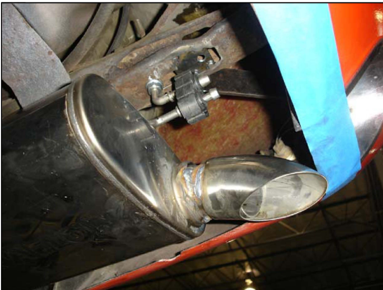
Fig # 2

Step 4: Once a final position has been chosen for the new system, evenly tighten all fasteners from front to rear. The supplied band clamps must be VERY tight to properly align the pipes and prevent leaks (Approximately 40ft-lbs). U-bolt clamps should be tightened to approximately 30-35ft-lbs. Inspect all fasteners after 25-50 miles of operation and retighten if necessary.