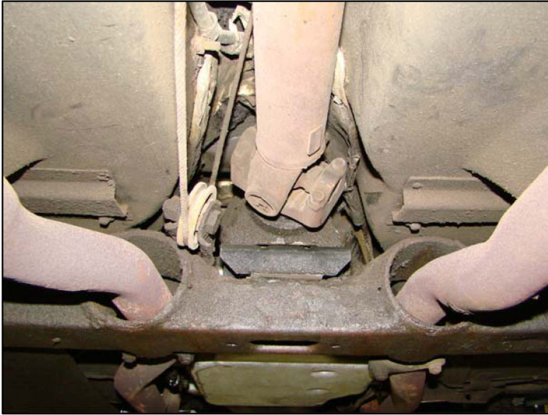
Fig # 1

Step 4: Once a final position has been chosen for the new system, evenly tighten all fasteners from front to rear. The supplied band clamps must be VERY tight to properly align the pipes and prevent leaks (Approximately 40ft-lbs). U-bolt clamps should be tightened to approximately 30-35ft-lbs. Inspect all fasteners after 25-50 miles of operation and retighten if necessary.