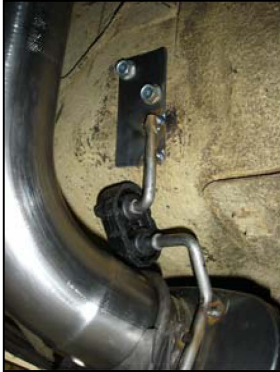
DIAGRAM 2 DRIVER'S SIDE