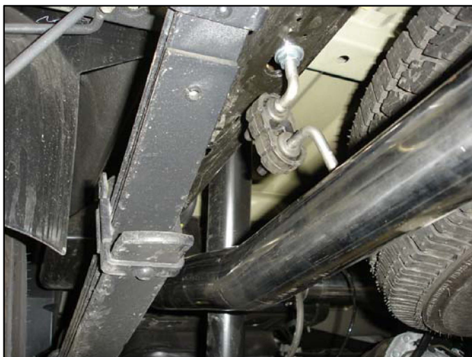
Dia # 2