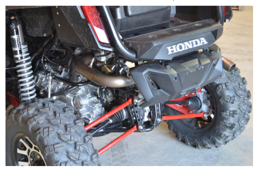
Congratulations! You are ready to begin experiencing the improved performance and driving excitement of your MBRP Exhaust upgrade. We know you will enjoy your purchase.

Note: In order to maintain optimal performance, the spark arrestor screen should be cleaned after the first 3 hours of use. Afterwards, clean every 30-35 hours of use.