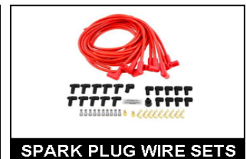
SPARK PLUG WIRE SETS

LKQ Specialty Products Group. (LKQ) warrants this product to be free of defects in material and workmanship at the time of purchase by the original retail consumer. LKQ disclaims any other warranties, express or implied, including the warranty of fitness for a particular purpose or an intended use. If the product is found to be defective, LKQ may replace or repair the product at our option, when the product is returned prepaid, with proof of purchase. Alteration to, improper installation, or misuse of this product voids the warranty. LKQ's liability is limited to repair or replacement of products found to be defective, and specifically excludes liability for any incidental or consequential loss or damage.