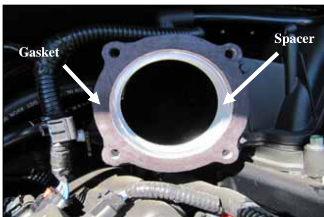
5. Insert the Airaid spacer into the intake manifold. The gasket will go between the spacer and the throttle body. *Note: Airaid spacer must be installed with bore protruding into intake manifold away from throttle body. Incorrect installation will hinder performance. Reference picture below for spacer orientation.