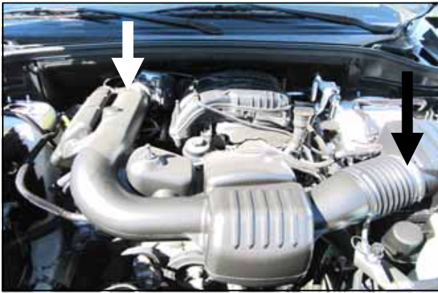
3. Loosen the clamps on both ends of the intake tube, and remove from the engine compartment.