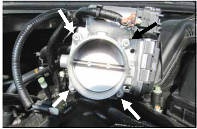
4. Remove the four bolts that secure the throttle body to the intake manifold. Without disconnecting the wiring harness, remove the throttle body from the intake manifold and set it to the side.