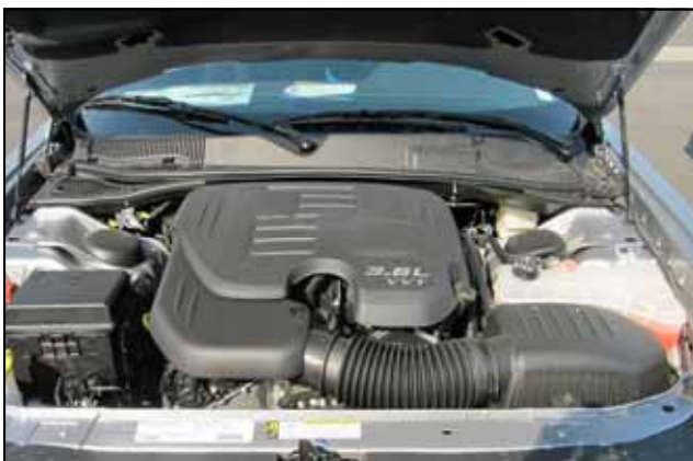
7. Reinstall the intake tube and engine cover in the reverse order that they were removed. Make sure to reconnect the temperature sensor.