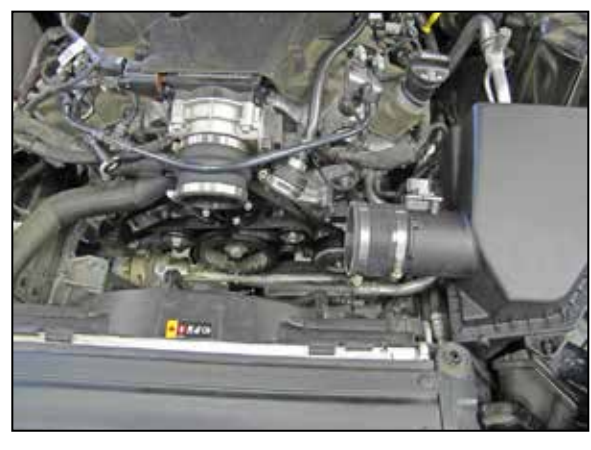
12. Install the coupling hoses onto the air filter housing and throttle body as shown.