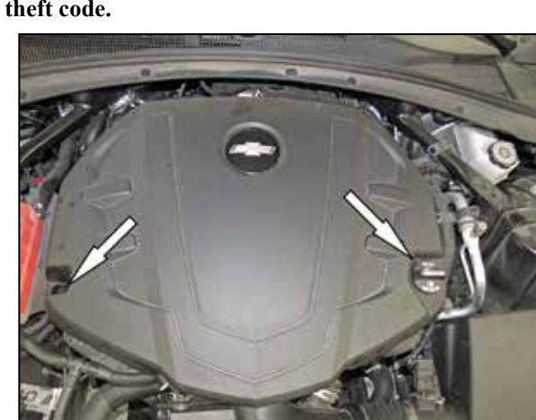
2. Remove the oil cap and bolt that secure the engine cover and then remove the engine cover from the vehicle.

NOTE: Disconnecting the negative battery cable erases pre-programmed electronic memories. Write down all memory settings before disconnecting the negative battery cable. Some radios will require an anti-theft code to be entered after the battery is reconnected. The anti-theft code is typically supplied with your owner's manual. In the event your vehicles anti-theft code cannot be recovered, contact an authorized dealership to obtain your vehicles anti-