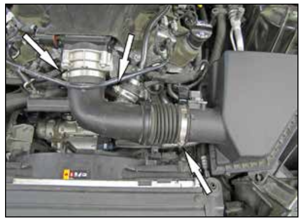
4. Loosen the hose clamp that secures the crank case vent line to the intake tube. Loosen the two hose clamps that secure the intake tube to the air filter housing and throttle body. Disconnect the tube from the air filter housing and throttle body.