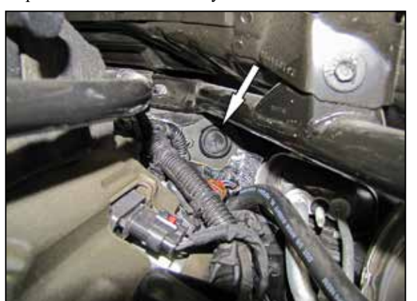
8. Install the provided plug into the hole for the sound tube in the firewall.