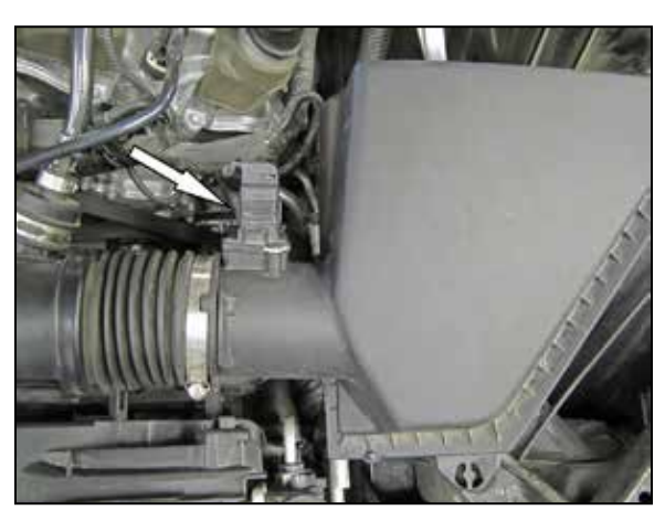
3. Slide the locking tab back and then disconnect the mass air sensor electrical connection.