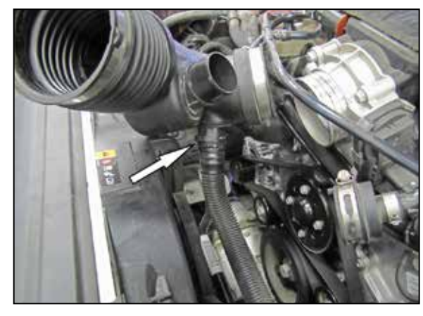
5. Lift up the intake tube to access the sound tube connection and then disconnect the sound tube from the intake tube and remove the intake tube from the vehicle.