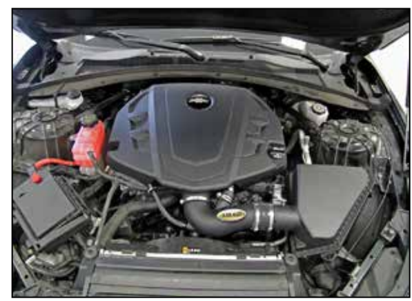
16. Double check your work!

Make sure there is no foreign material in the intake path. Make sure all clamps, hoses, bolts, and screws are tight. Double check the hood clearance!