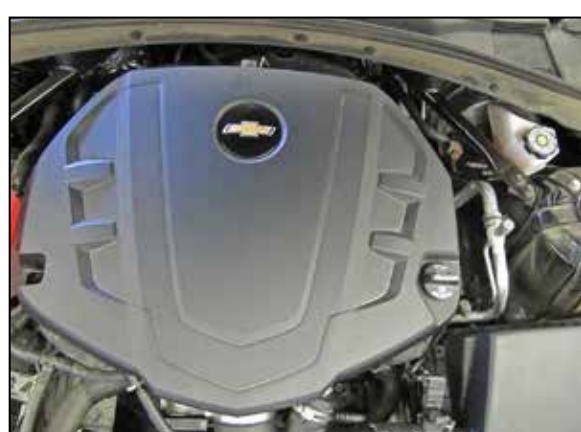
15. Reinstall the engine cover and secure with the factory hardware.