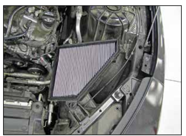
9. On AIRAID Jr. kits ONLY , remove the air filter housing lid and replace the stock air filter with the provided AIRAID filter, reinstall the lid and secure with the factory hardware.