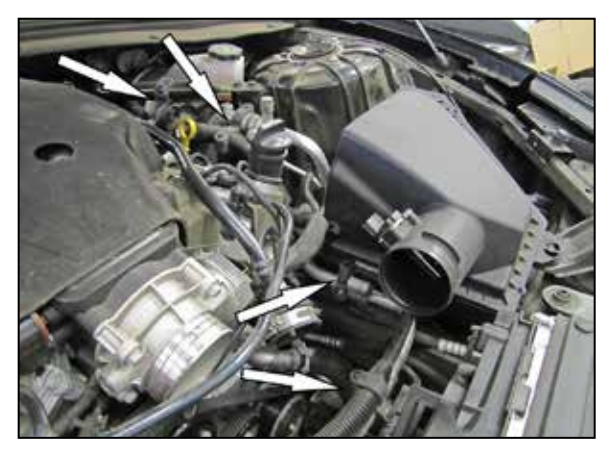
6. Release the four sound drum tube mounts.