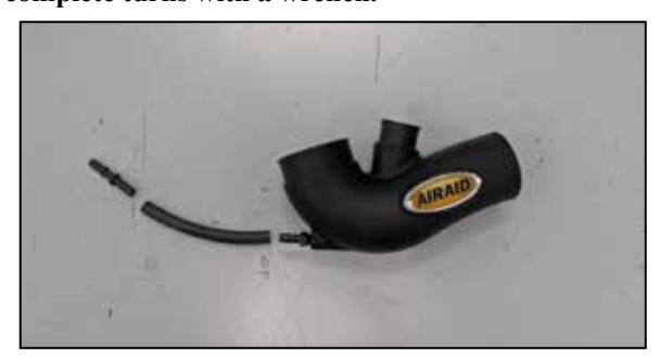
11. Install the provided vent hose and quick disconnect fitting onto the intake tube.

NOTE: Plastic NPT fittings are easy to cross thread. Install the vent fitting "hand" tight, then turn it two complete turns with a wrench.