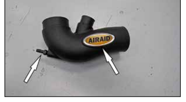
10. Install the AIRAID decal onto the intake tube. Install the provided 1/4npt into the intake tube.

NOTE: Plastic NPT fittings are easy to cross thread. Install the vent fitting "hand" tight, then turn it two complete turns with a wrench.