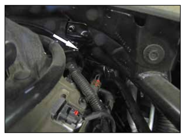
7. Remove the bolt that secures the sound tube to the firewall and then rotate the tube clockwise to remove the complete sound tube assembly.