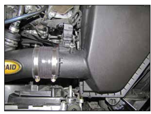
14. Reconnect the mass air sensor electrical connection.