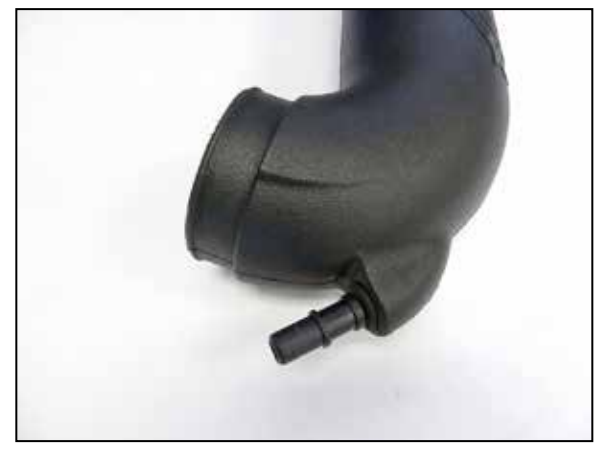
8. Install the provided grommet and quick connect fitting into the AIRAID<sup>®</sup> intake tube as shown.