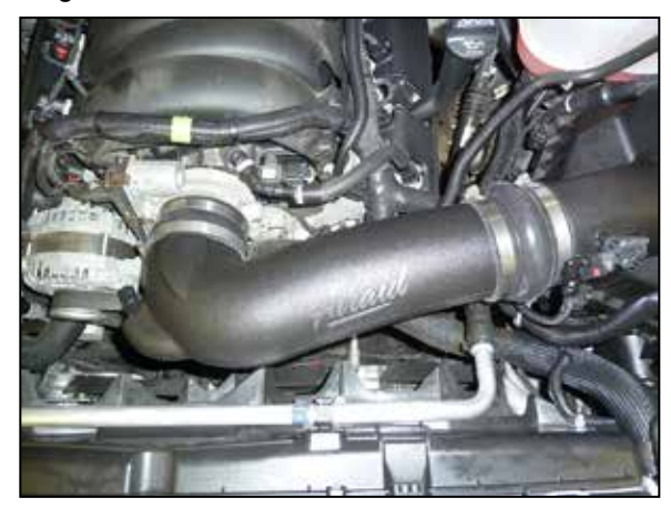
9. Install the AIRAID<sup>®</sup> intake tube into the hump coupler and then the coupler at the throttle body, adjust the tube for best fit and secure with the provided hose clamps.