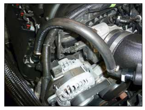
11. Install the crank case hose assembly onto the quick connect fittings on the intake tube and valve cover as shown.