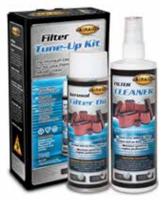
P/N 790-551 Aerosol Spray P/N 790-550 Squeeze Spray