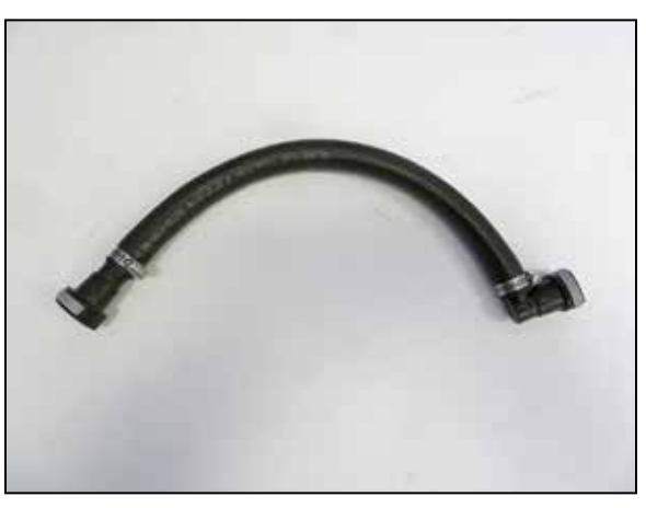
10. Assemble the crank case hose assembly as shown.