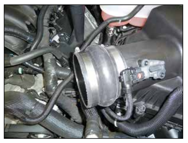
7. Install the provided hump coupler onto the filter housing and secure with the provided hose clamp.