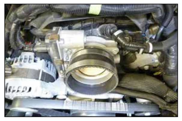
6. Install the provided coupler onto the throttle body. 5.3L engines will use the smaller coupler and 6.2L engines will use the larger coupler.

5. Remove the factory air filter and replace with the AIRAID<sup>®</sup> air filter provided. Reinstall the air filter housing lid and secure with the factory screws.