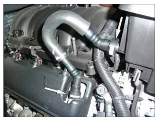
2. Depress the locking tabs and then remove the crank case vent hose assembly.

3. Loosen the two hose clamps that secure the intake plenum to the throttle body and the air filter housing and then remove the intake plenum from the vehicle.