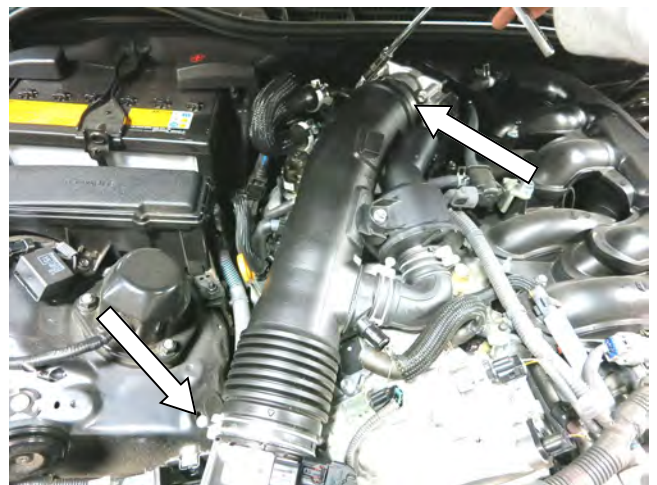
d. Loosen the stock hose clamps on both ends of the intake tube using a 10mm socket and remove the tube.