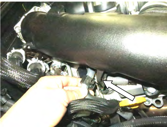
c. Detach the vacuum line harness from the intake tube as shown.