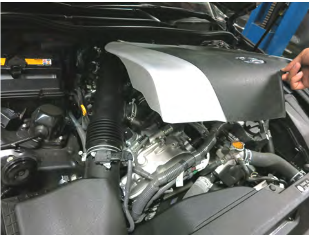
a. Lift up the engine cover and set aside.