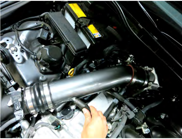
e. Reconnect the breather hose to the AEM tube.