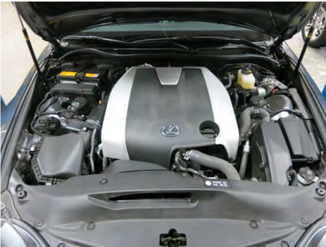
g. Factory air induction system.