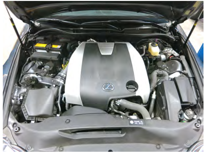
h. Finished installation of AEM Intake System.