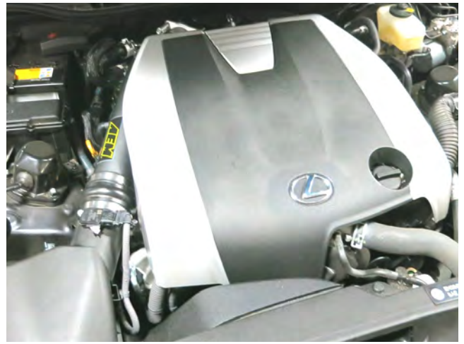
f. Reinstall the engine cover. Check for clearance between the tube, engine, and engine cover prior to fastening all hose clamps.