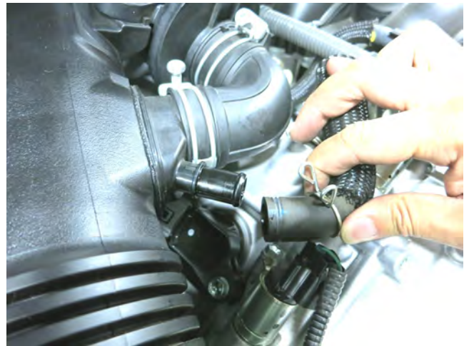
b. Disconnect the breather hose from the stock intake tube.