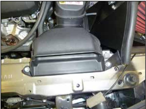
13. Install the fresh air intake duct and secure with the factory hardware.