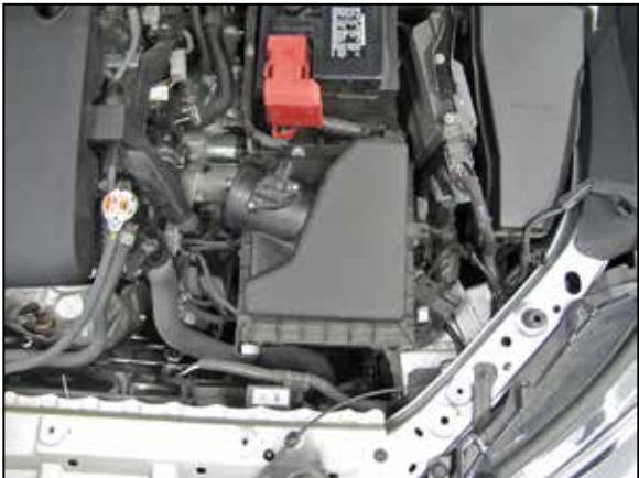
6. Lift up the air filter housing to dislodge it from the mounting grommets and then remove the housing from the vehicle.