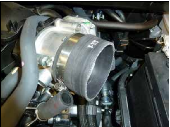
12. Install the provided coupler hose (5-326) onto the throttle body and secure with the provided hose clamp.