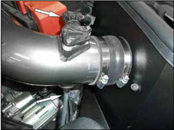
18. Connect the vacuum line to the AEM® intake tube and reconnect the mass air sensor electrical connection.