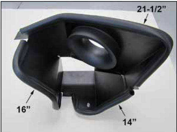
8. Cut the provided top bulb edge trim into sections of 21-1/2", 16" and 14" and then install them onto the heat shield as shown.