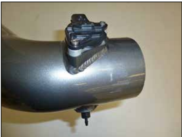
15. Remove the mass air sensor from the factory air filter housing and install it into the AEM® intake tube using the provided hardware. Install the provided vacuum fitting into the AEM® intake tube. NOTE: Plastic NPT fittings are easy to cross thread. Install the vent fitting "hand" tight, then turn it two complete turns with a wrench.