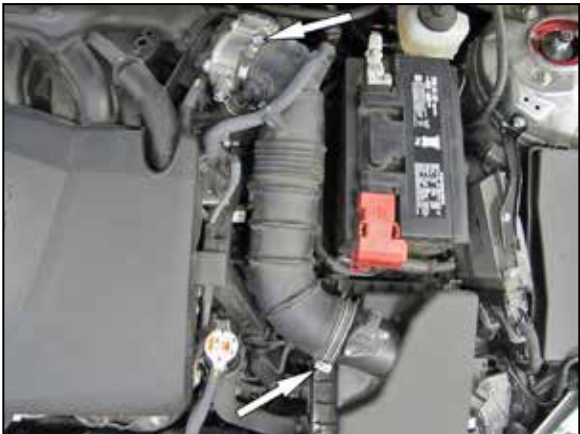
5. Loosen the hose clamps that secure the intake tube to the throttle body and air filter housing, unhook the vent lines attached to the intake tube and then remove the tube from the vehicle.