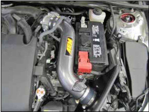
16. Install the AEM® intake tube into the Coupling hoses, adjust the tube for best fit and then secure with the provided hose clamps.