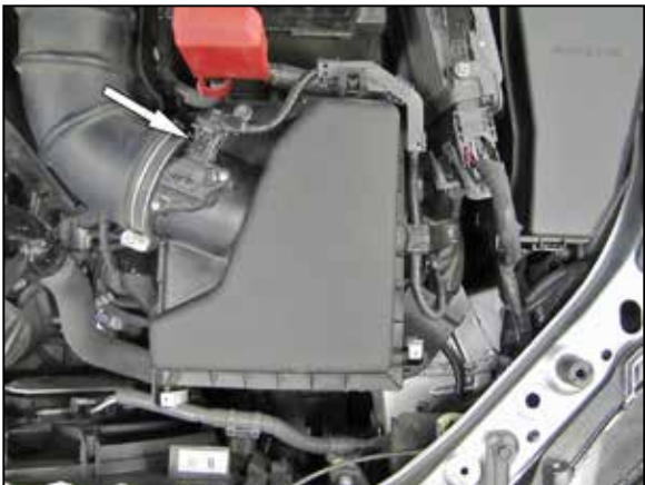
4. Disconnect the mass air sensor electrical connection and unclip the wiring harness from the air filter housing.