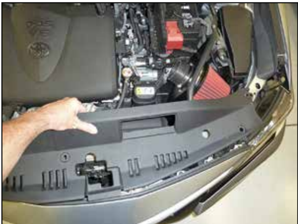
14. Reinstall the radiator cover and secure with the factory push clips.