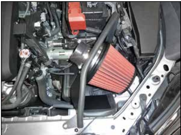
11. Install the heat shield assembly into the vehicle so the mounting studs engage the factory mounting grommets.