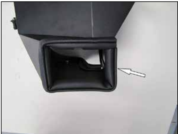
9. Install the side bulb edge trim onto the heat shield as shown.