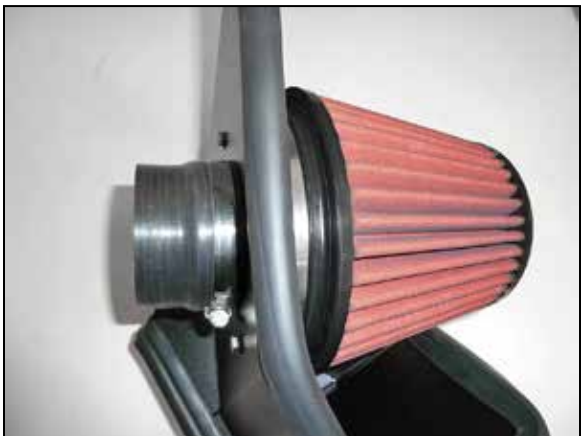
10. Install the provided air filter and coupling hose (5-352) onto the filter adapter and secure with the provided hose clamps.