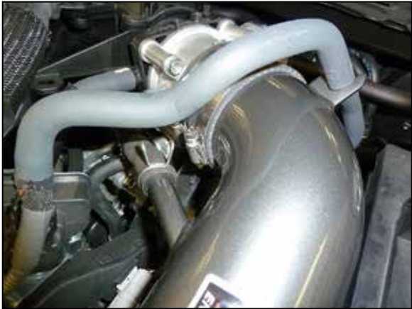
17. Connect the factory crank case vent line to the vent tube on the AEM® intake tube and secure the brake booster vacuum line to the intake tube as shown.