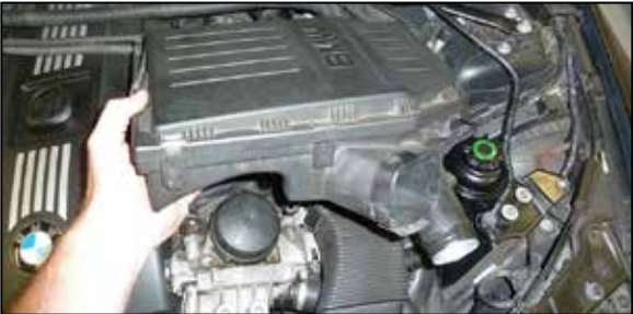
9. Pull the factory air filter housing straight upwards to dislodge it from the mounting grommets and then remove it from the vehicle.

NOTE: AEM recommends that customers do not discard factory air intake.