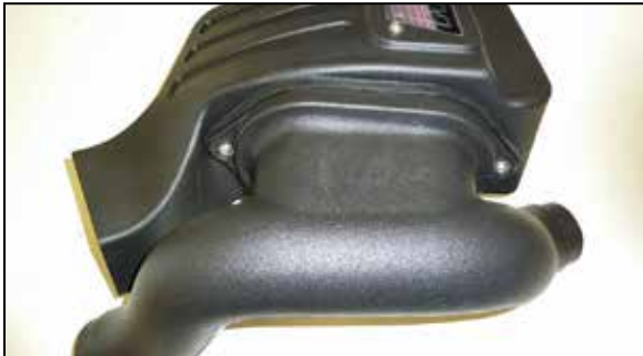
14. Place the provided gasket onto the tube assembly and then install the tube assembly into the AEM housing and secure with the provided hardware.