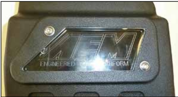
11. Install the AEM badge into the AEM air filter housing and secure with the provided hardware.