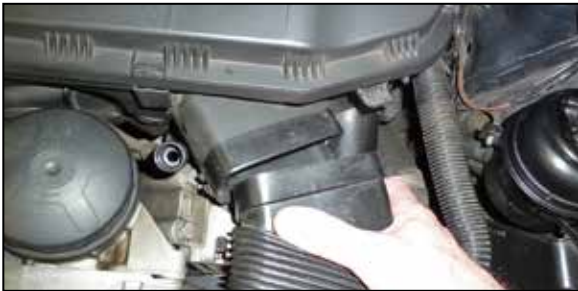
8. Disconnect the fresh air intake duct from the air filter housing.