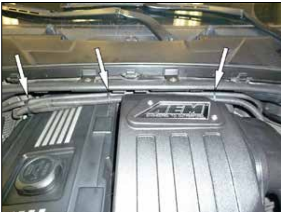
17. Use the provided tie wraps and secure the wiring as shown.