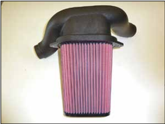
13. Install the AEM air filter into the tube assembly as shown.