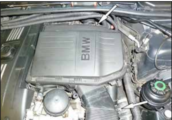
7. Loosen the hose clamps that secure the intake tubes to the factory air filter housing.