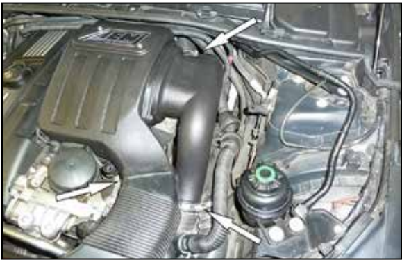
15. Install the AEM intake assembly onto the factory mounting pins, then align and connect the fresh air intake duct. Connect the factory intake tubes to the AEM housing and then secure with the factory hose clamps.