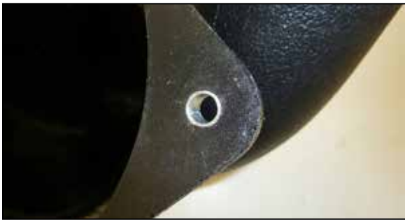
12. Install the two provided bushings into the AEM tube assembly as shown.