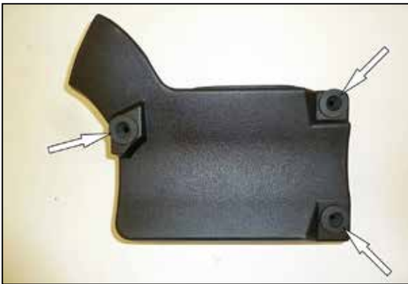
10. Remove the three mounting grommets from the factory air filter housing and install them into the AEM air filter housing as shown.

NOTE: AEM recommends that customers do not discard factory air intake.