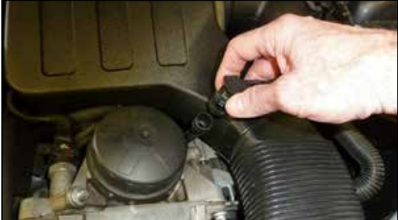
16. Reconnect the vacuum breather hose.