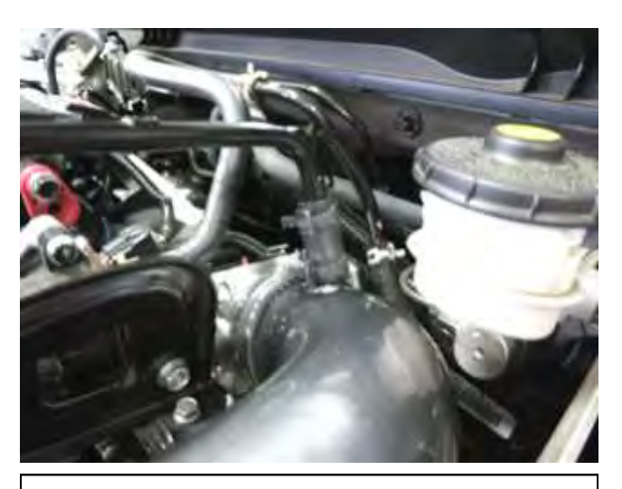
I. Align the previously installed hose on the AEM intake to the factory vent hard line and secure with the spring clamp.