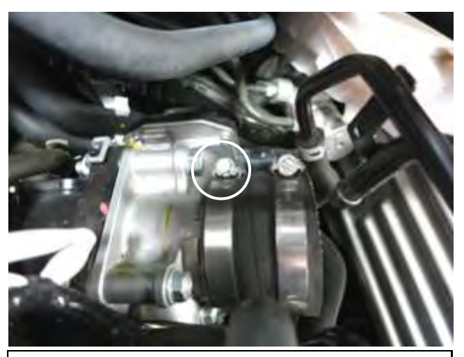
b. Install the provided coupler and hose clamps onto the throttle body. Tighten the circled hose clamp (30 in. lb.) at this time.