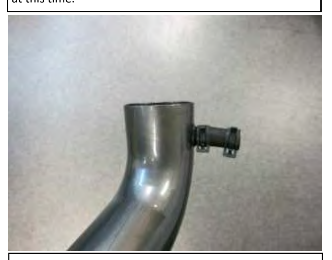
d. Install the provided hose and spring clamps onto the AEM intake tube. Trimming to 1.5" may be necessary.