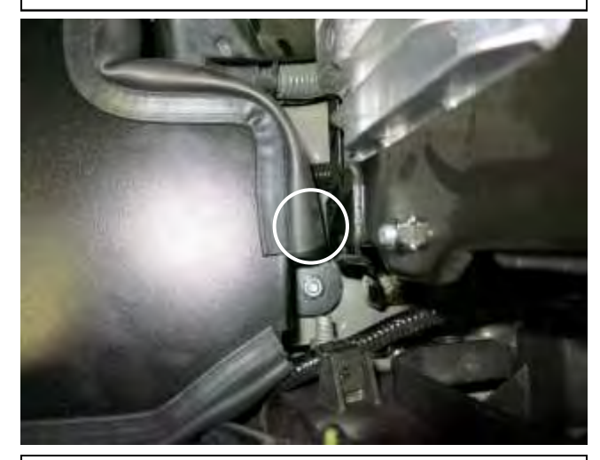
j. With the provided hardware, secure the AEM heat shield to the previously installed rubber mount on the frame rail.