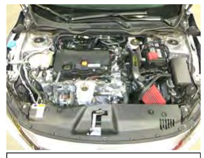
AEM INTAKE INSTALLED