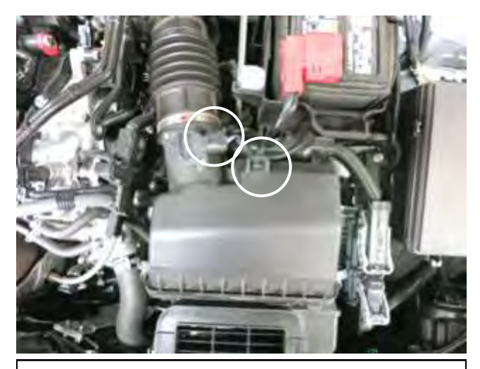
c. Depress the MAF (Mass Air Flow ) sensor connector tab and remove the connector from the sensor. Then, disconnect the green zip tie from the harness.