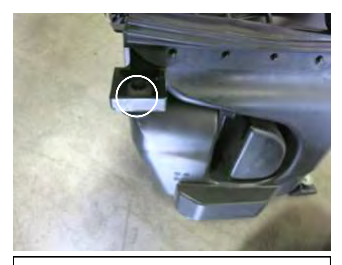
k. Remove the grommet from the lower air box. This will be reused in step 3f.