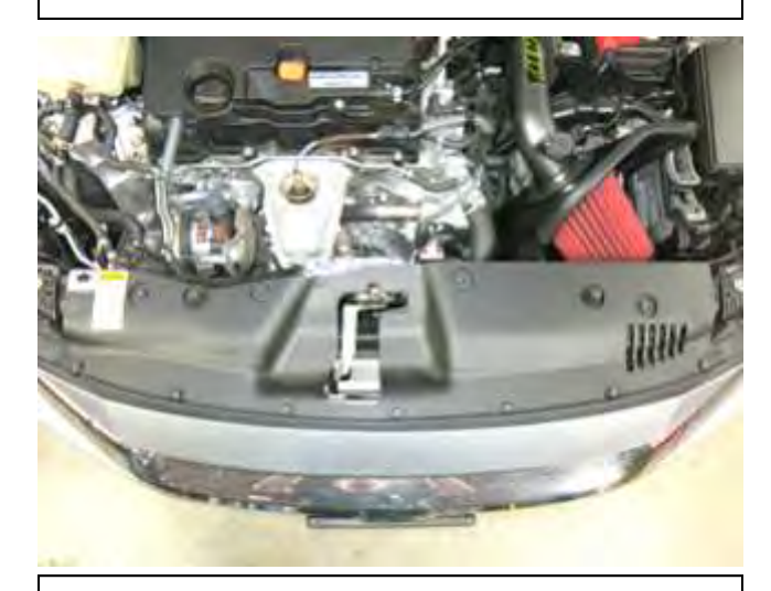
p. Re-install the front shroud cover on to the vehicle with the nine push-in clips removed in step 2a.