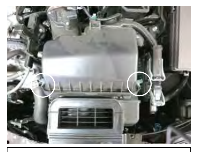
e. Unlatch the two clips on the stock air box.