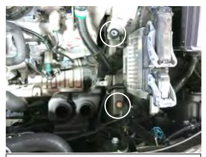
a. Install the two rubber mounts into the vehicle as shown.

a. When installing the intake system, do not completely tighten the hose clamps or mounting hardware until instructed to do so.