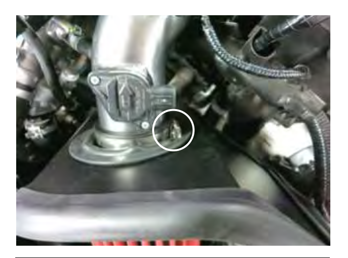
m. Connect the AEM intake tube to the AEM filter, and tighten the hose clamp (30 in. lb.) to secure the filter to the tube. Connect the MAF sensor connector.