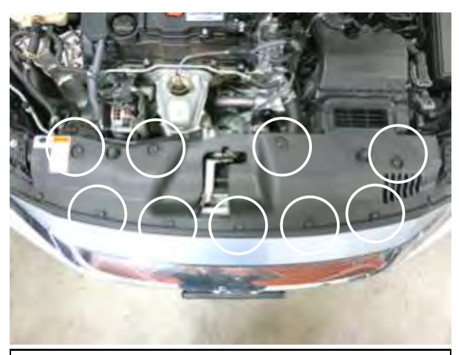
a. Remove the nine push-in clips, and remove the front shroud cover.