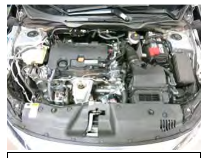
STOCK INTAKE INSTALLED