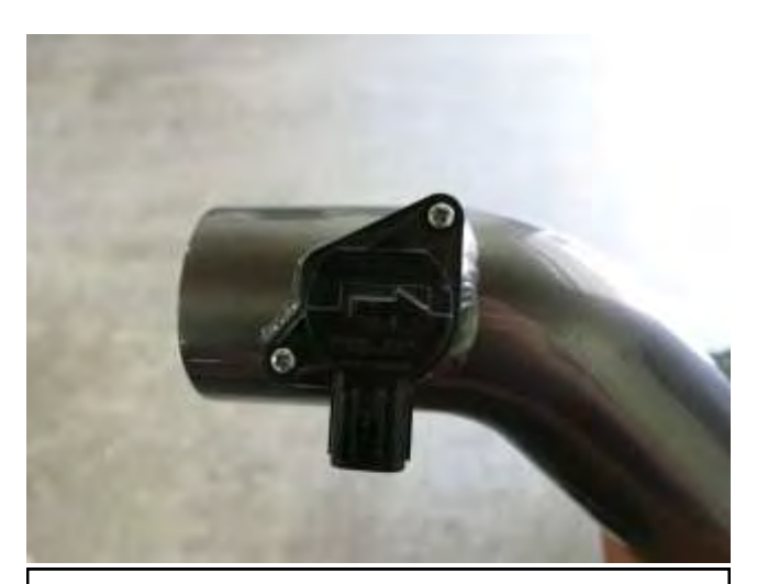
c. Install the MAF sensor into the AEM tube with the hardware that was removed in step 2l.