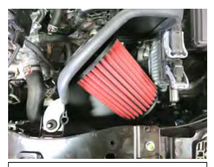
k. Lower the AEM filter with hose clamp into the AEM heat shield as shown.