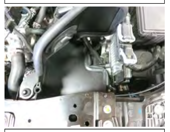
g. Install the AEM heat shield into the vehicle as shown, routing it around the electrical harness.