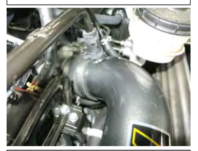
n. Connect the other end of the AEM intake tube into the coupler that was installed on the throttle body.