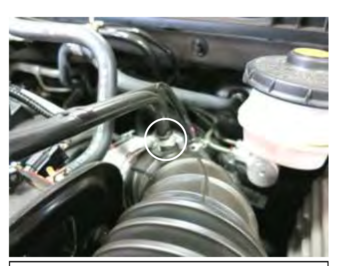
d. Squeeze the spring clamp on the vent line and remove the vent line from the stock intake tube.