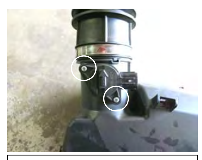
I. Remove the two screws and pull the MAF sensor from the stock upper air box. They will be reused in step 3c.