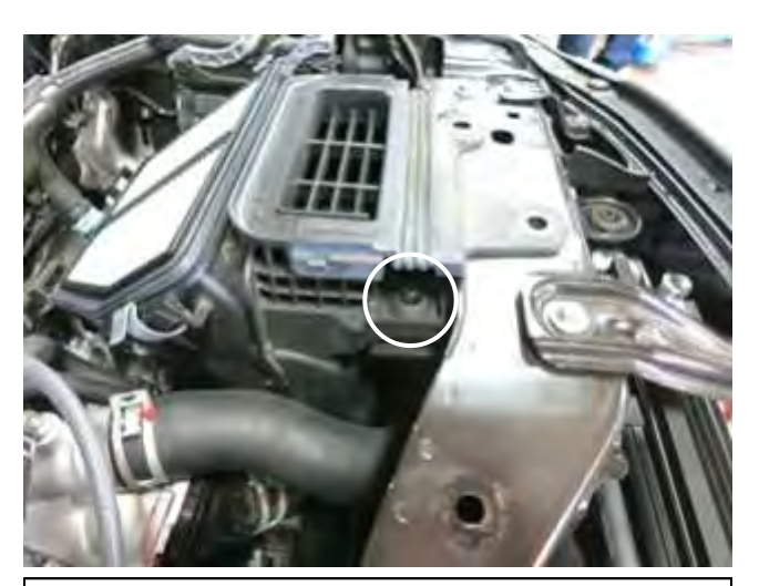
i. Lift the lower air box out of the vehicle making sure to disconnect the grommet from the vehicle.