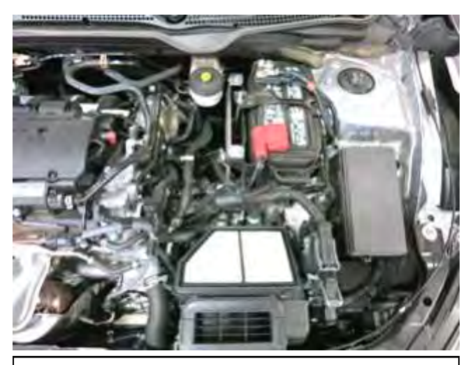
g. Remove the upper air box with the intake arm.