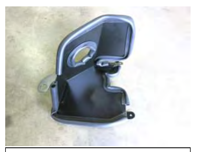
e. Install the provided edge trim as shown. Trimming the edge trim will be necessary.