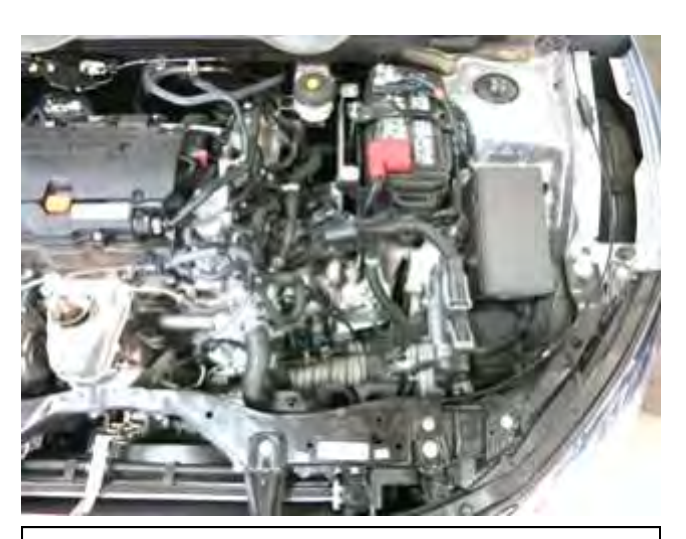
j. Lower air box removed.