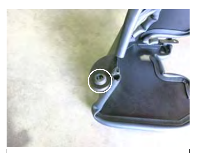
f. Install the grommet that was removed in step 2k. as shown.