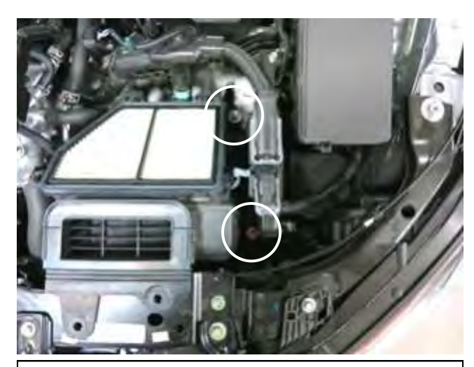
h. Remove the two bolts that secure the lower air box to the vehicle.