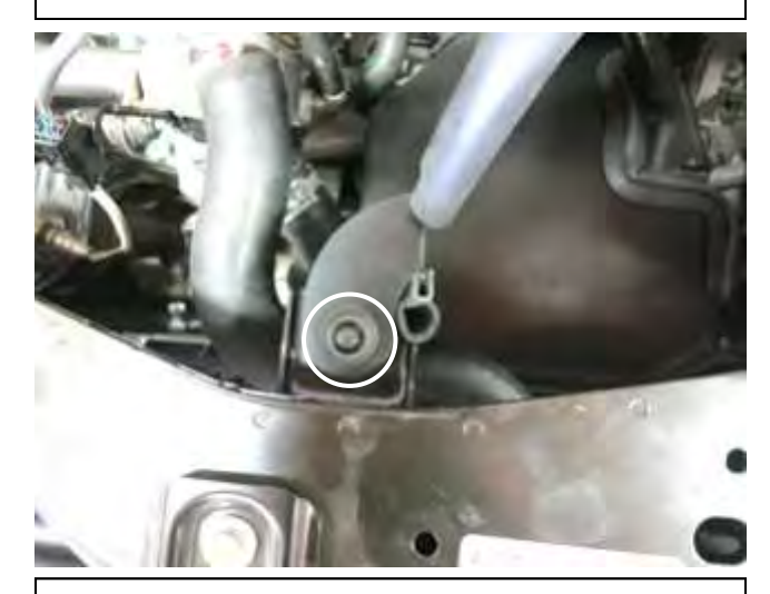
h. Seat the grommet onto the air box post as shown. Note: On 2022 and later models it will be necessary to secure the heat shield with the factory air box mounting bolt.