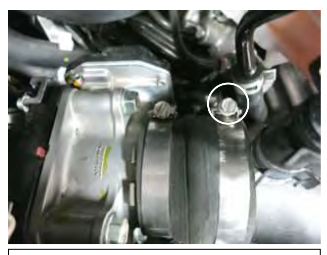
o. Once the AEM intake tube is properly aligned with the coupler and the heat shield, tighten the circled hose clamp (30 in. lb.).