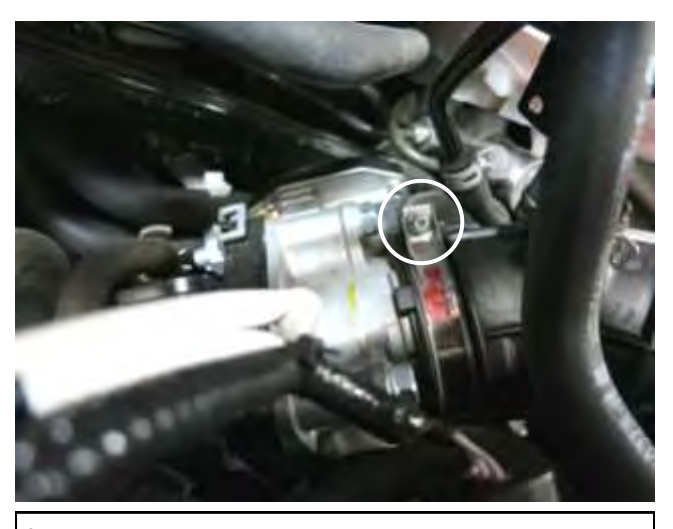
f. Loosen the hose clamp at the throttle body.