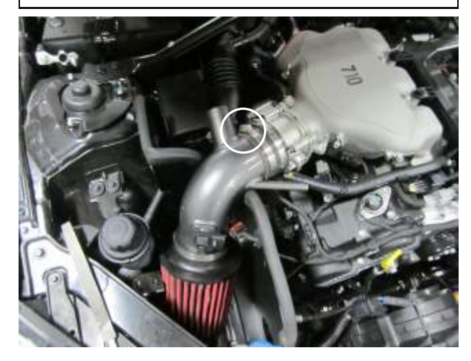
j. Install the AEM intake tube into the coupler and tighten the other hose clamp.