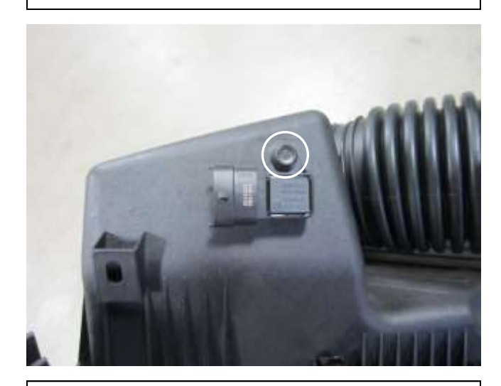
j. Loosen the bolt that secures the temperature sensor to the air box. Note: These will be reused in step 3a.