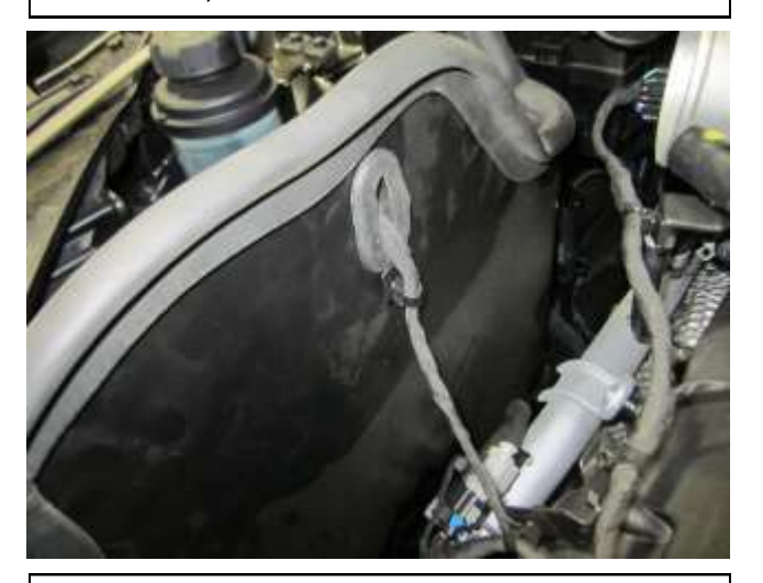
g. Slide the temp. sensor connector through the grommet (784640) and heat shield, then squeeze the grommet and install into the heat shield as shown.