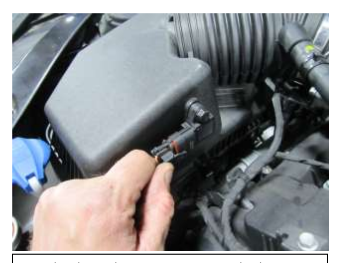
c. Unplug the intake temperature sensor by depressing the clip and pulling away from sensor.