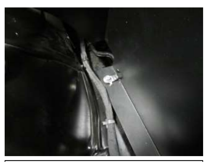
c. Install the heat shield into the vehicle on top of the spacer previously installed in step 3b. Pull the ground strap through the heat shield. Install the bolt (22224) through the two washers (1-3025 & 08275), the heat shield, and the spacer and tighten to the vehicle.