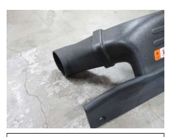
o. Place the adapter scoop into the stock scoop.