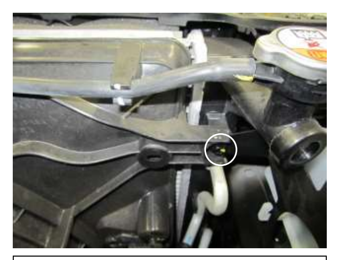
d. Align the heat shield flange with the fan shroud and install the bolt that was removed in step 2h.