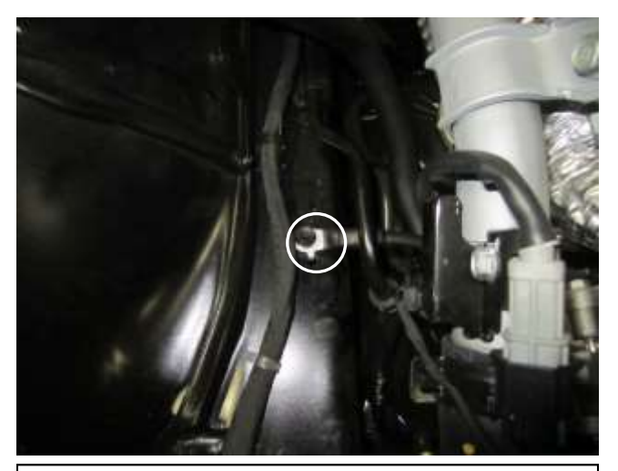
g. Remove the ground strap bolt located underneath the air box. This bolt will not be reused.