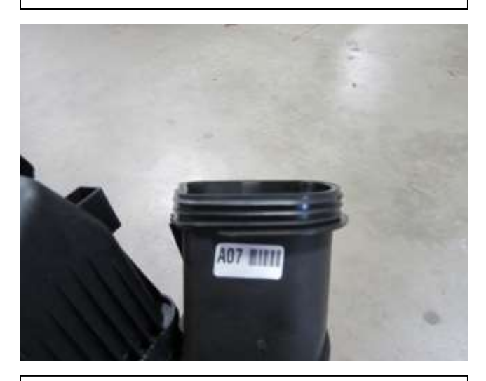
i. Remove the seal off of the stock air box. Note: This will be reused in step 3n.