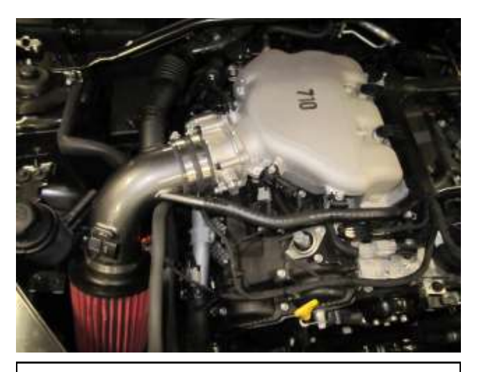
I. Slide the vent tube onto the AEM intake and secure with the stock spring clamp.