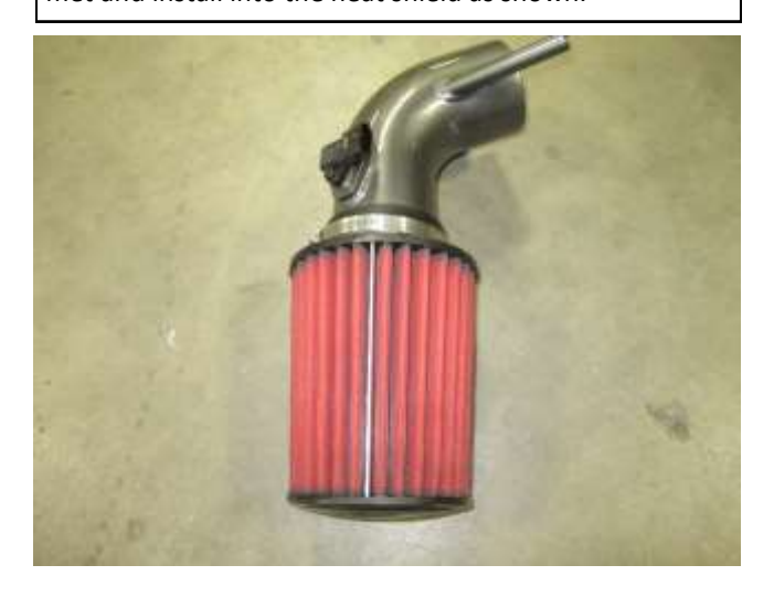
i. Install hose clamp (9456) and AEM filter onto the intake tube. Tighten clamp.