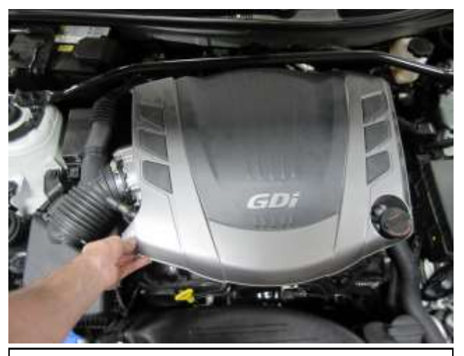
a. Pull up on the engine cover and remove it.