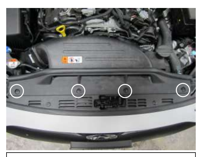
b. Remove the 4 plastic screws that hold down the air scoop. Note: These will be reinstalled in step 3p.