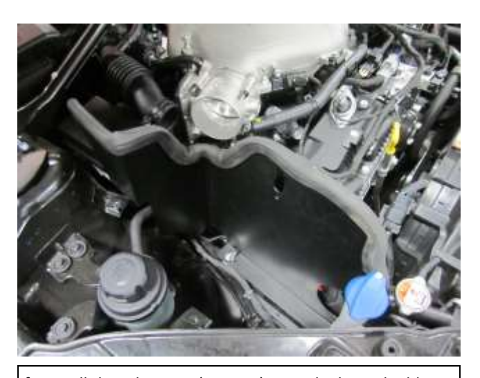
f. Install the edge trim (102496) onto the heat shield at this time.