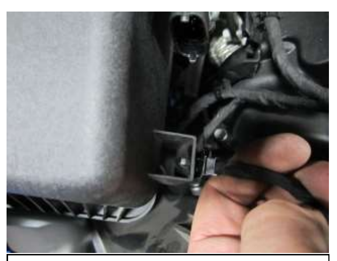
d. Unclip the wiring harness clip from the stock air box.