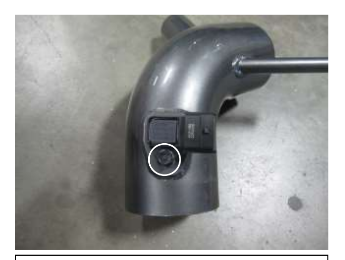
a. Install the temperature sensor into the AEM intake tube and secure with the bolt removed in step 2j.

When installing the intake system, do not completely tighten the hose clamps or mounting hardware until instructed to do so.