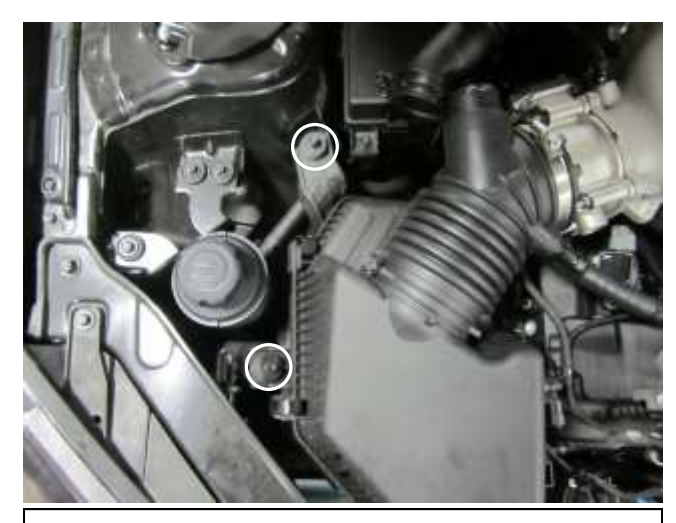
f. Remove the two bolts shown that secure the stock air box to the vehicle. Then remove the air box. NOTE: Do not discard any of your stock intake equipment.