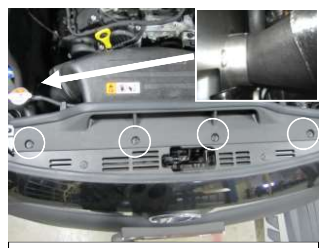
p. Install the scoop into the vehicle aligning the scoop adapter into the hole in the heat shield. Reinstall the engine cover.