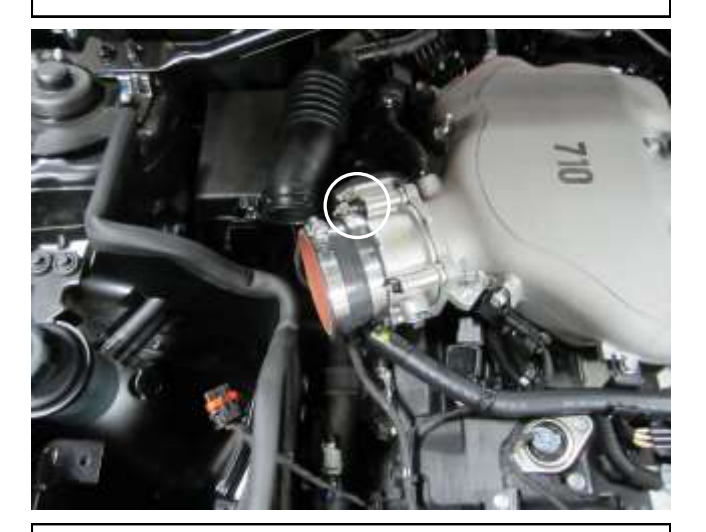
h. Install the coupler (5-351)and hose clamps (9456) onto the throttle body. Tighten the hose clamp on the throttle body side at this time.