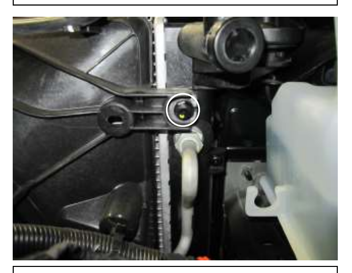
h. Remove the bolt on the front fan shroud. Note: These will be reused in step 3d.