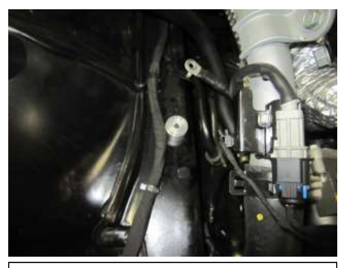
b. Install the provided spacer (06555) onto the vehicle