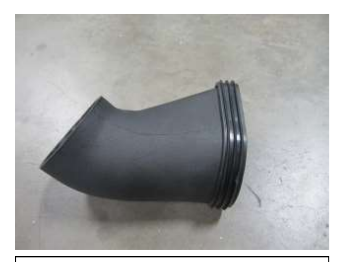
n. Install the seal onto the adapter scoop (9-0437) that was removed in step 2i.