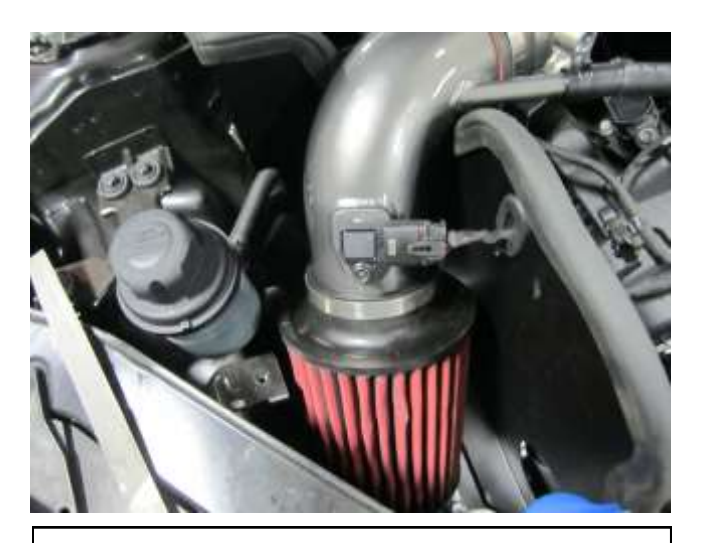
m. Connect the temperature sensor connector to the sensor.