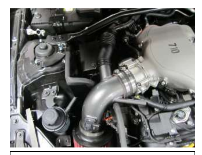
k. Slide the sound tube onto the AEM intake and secure with the stock clamp.