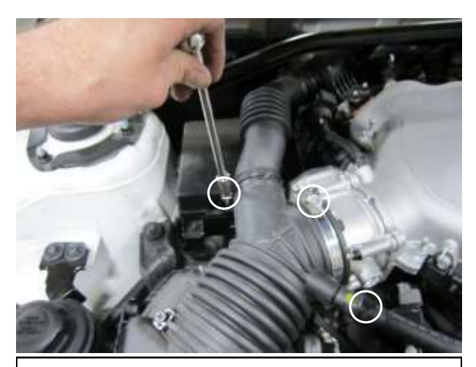
e. Loosen the hose clamps at the sound tube, the throttle body, and unclip the spring clamp on the vent line.