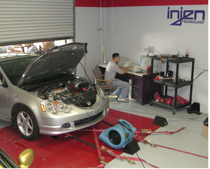
Injen Technology Research & Development Team seen here testing its final design on Injen's own in-ground Dyno-jet.