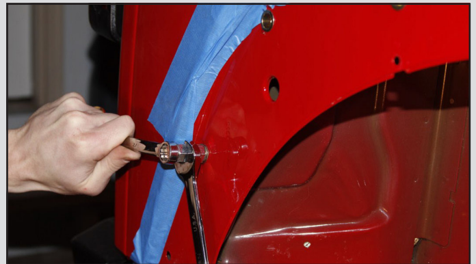
IMAGE MAY NOT MATCH THIS PART INSTALLATION. IT IS FOR ILLUSTRATION OF THE USE OF THE TOOL ONLY.

B. Insert the knurled end of the rivet-nut into the hole, pressing its flange firmly against the Jeep's sheet metal. Use an end wrench to hold the coupler nut stationary while turning the head of the bolt clockwise with a ratchet and socket. As the ratchet is turned, the bolt will draw the far end of the rivet-nut toward the inside of the sheet metal, gripping it with the knurled outside edge of the nut-sert as it deforms.