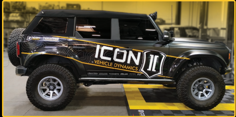
IMAGE SHOWN WITH OVERLAND SPRING INSTALLED WITH NO ADDITIONAL WEIGHT