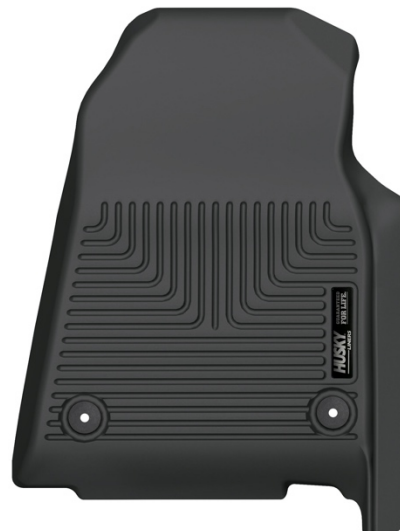
RIGHT OR PASSENGER'S

TO EASE INSTALLATION OF YOUR NEW FRONT LINERS, MOVE BOTH FRONT ROW SEATS TO THEIR MOST REARWARD POSITION. WITH THIS DONE, INSTALL THE LINERS AS SHOWN ABOVE. THE DRIVER AND PASSENGER SIDE LINER WILL ATTACH TO THE FACTORY FLOOR MAT RETAINING POSTS. ONCE YOU HAVE INSTALLED YOUR LINERS, REPOSITION THE SEATS AS DESIRED.