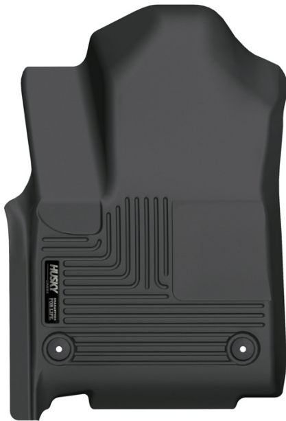
LEFT OR DRIVER'S