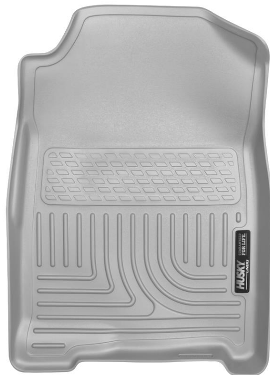
RIGHT OR PASSENEGER'S SIDE

TO EASE INSTALLATION OF YOUR CR-V FRONT FLOOR LINERS, FIRST SLIDE BOTH FRONT ROW SEATS BACK TO EXPOSE THE FRONT FLOOR PANS. INSTALL LINERS TAKING CARE TO ATTACH THE DRIVER'S SIDE LINER TO THE FACTORY TWIST-LOCK RETAINERS. ONCE YOU HAVE INSTALLED THE FRONT LINERS, REPOSITION THE FRONT SEATS AS DESIRED.