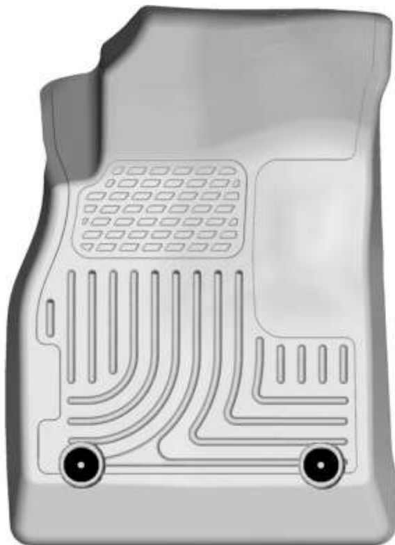
LEFT OR DRIVER' SIDE