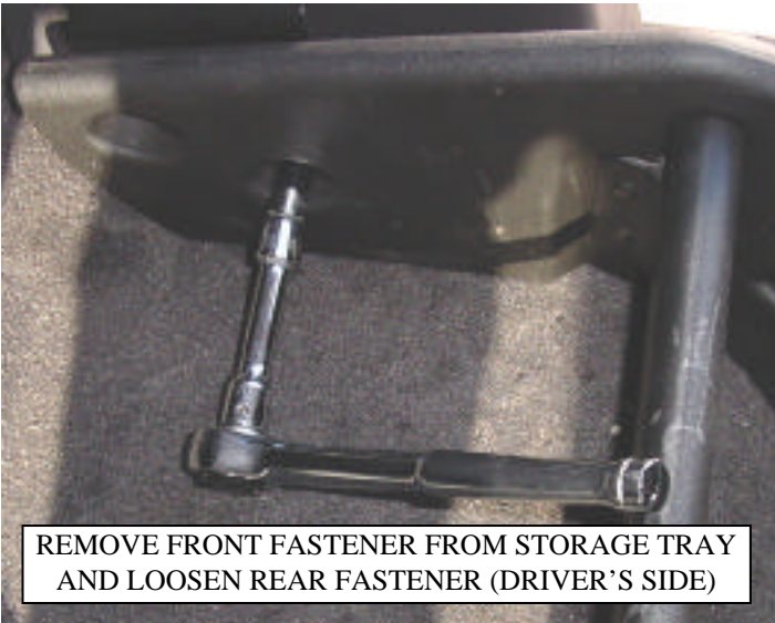
REMOVE FRONT FASTENER FROM STORAGE TRAY AND LOOSEN REAR FASTENER (DRIVER'S SIDE)