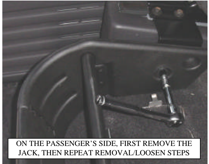
ON THE PASSENGER'S SIDE, FIRST REMOVE THE JACK, THEN REPEAT REMOVAL/LOOSEN STEPS