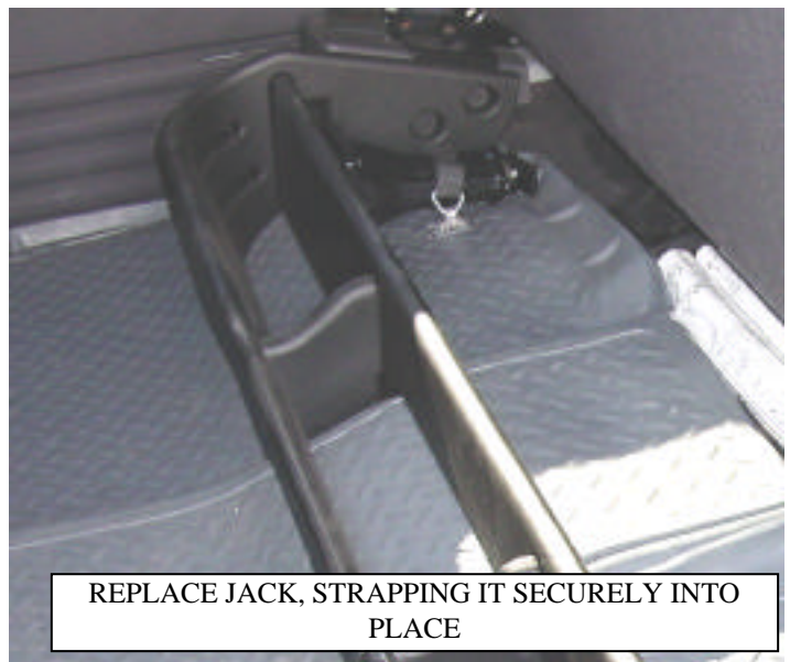
REPLACE JACK, STRAPPING IT SECURELY INTO PLACE