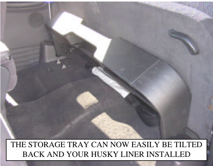
THE STORAGE TRAY CAN NOW EASILY BE TILTED BACK AND YOUR HUSKY LINER INSTALLED