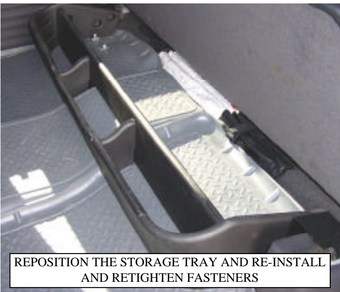
REPOSITION THE STORAGE TRAY AND RE-INSTALL AND RETIGHTEN FASTENERS