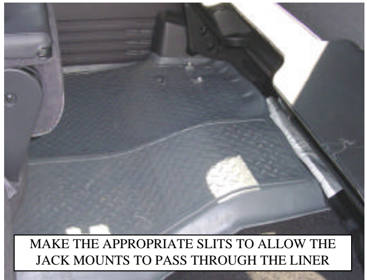
MAKE THE APPROPRIATE SLITS TO ALLOW THE JACK MOUNTS TO PASS THROUGH THE LINER