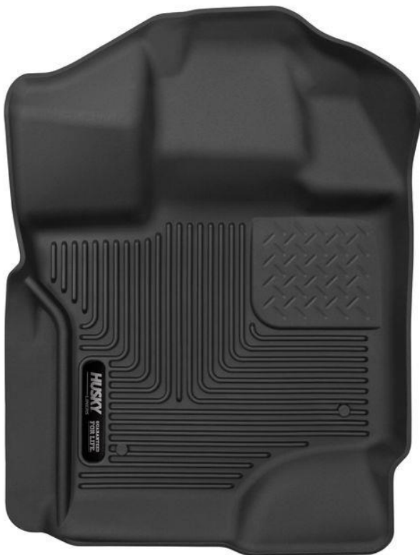
LEFT OR DRIVER

Your liners are made from an engineering resin that is lightweight and extremely tough and durable. The easiest way to clean your liners is with a damp cloth or sponge and soap and water. Windex®, 409® and ArmorAll® type cleaners work as well.