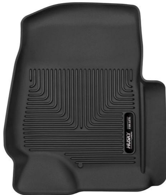
RIGHT OR PASSENGER

TO INSTALL DRIVER'S SIDE LINER SIMPLY POSITION LINER OVER EXISTING RETAINER AND PRESS DOWN TO SEAT LINER OVER THE RETAINER. INCLUDED IN YOUR PACKAGING IS AN ADDITIONAL RETAINING POST FOR THE PASSENGER SIDE. SEE INSTALLATION DETAILS ON THE BACK OF THIS PAGE.