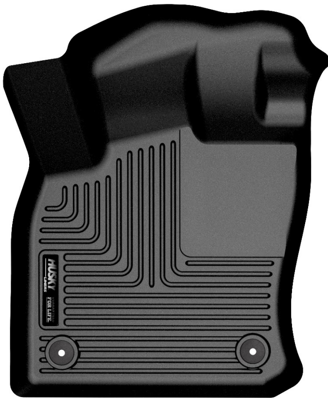
LEFT OR DRIVER'S SIDE