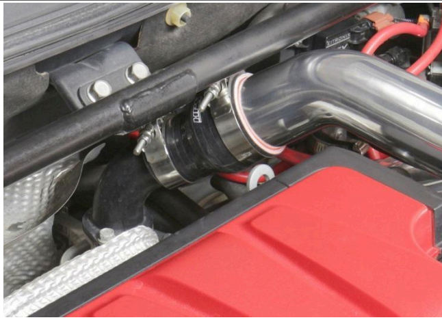
8. Secure the T-bolt clamps on the turbo side.