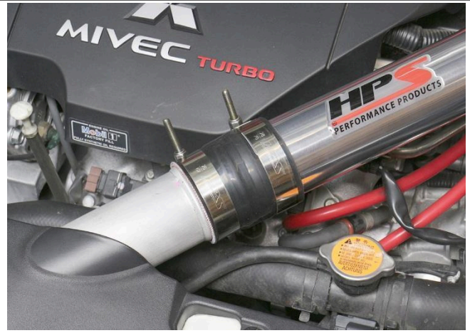
9. Secure the T-bolt clamps on the intercooler side.